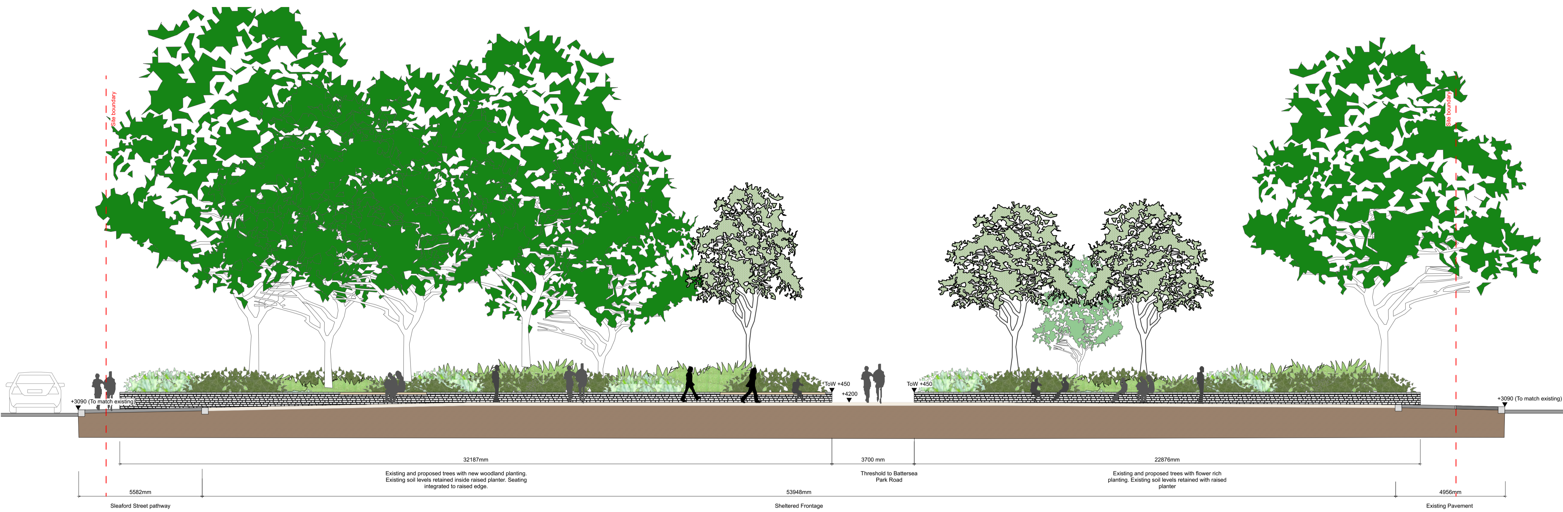
1 Section EE Scale: 1:100