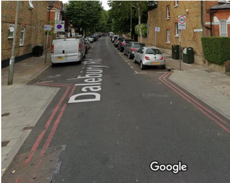
Trinity Road junction with Dalebury Road

Make new TRO which converts the free parking bay on the right to a 30min parking between 7am and 7pm with no return in 1 hour. This will match the bay on the left-hand side.