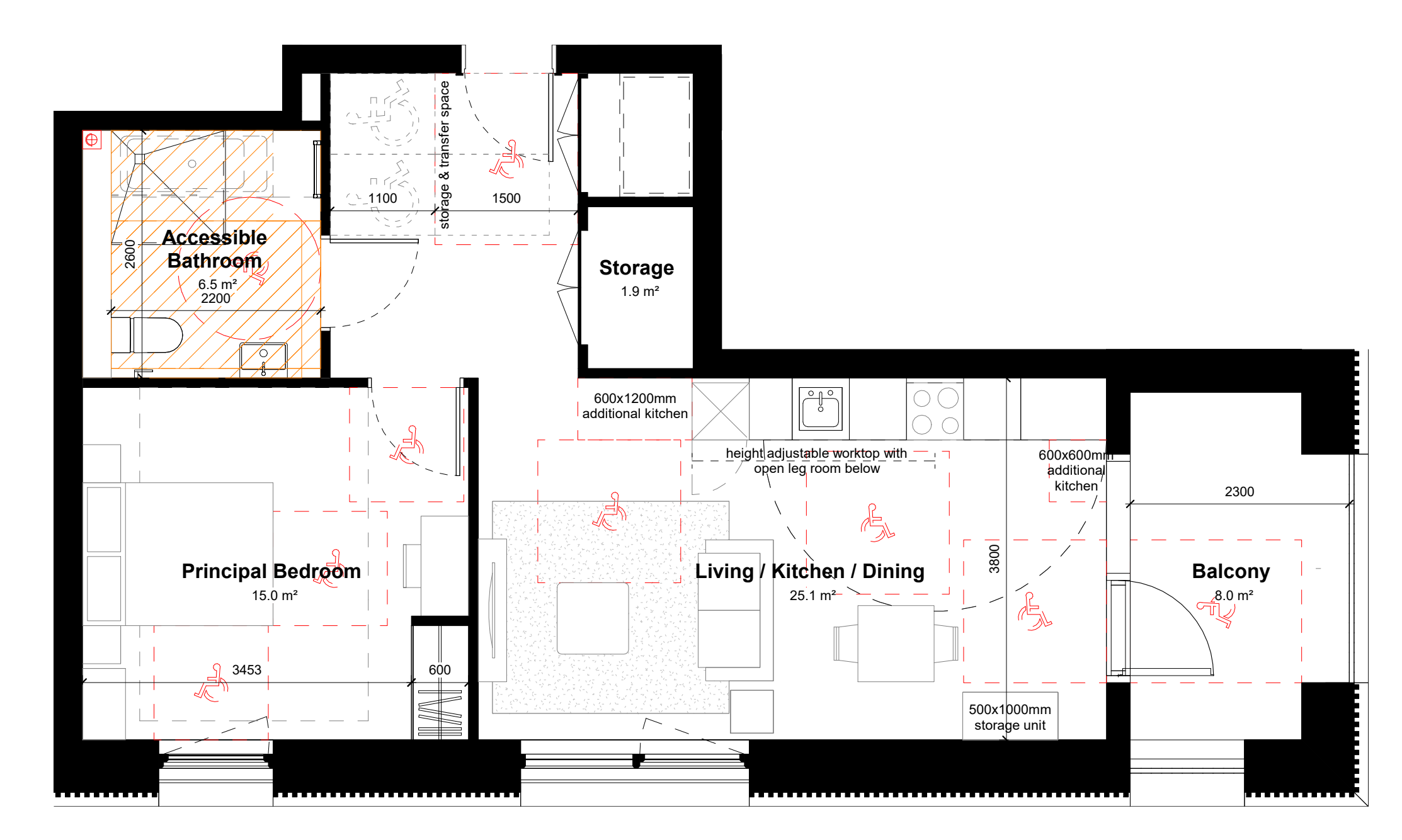
01 - 1 Bedroom 2 Person Wheelchair User Adaptable Apartment Layout