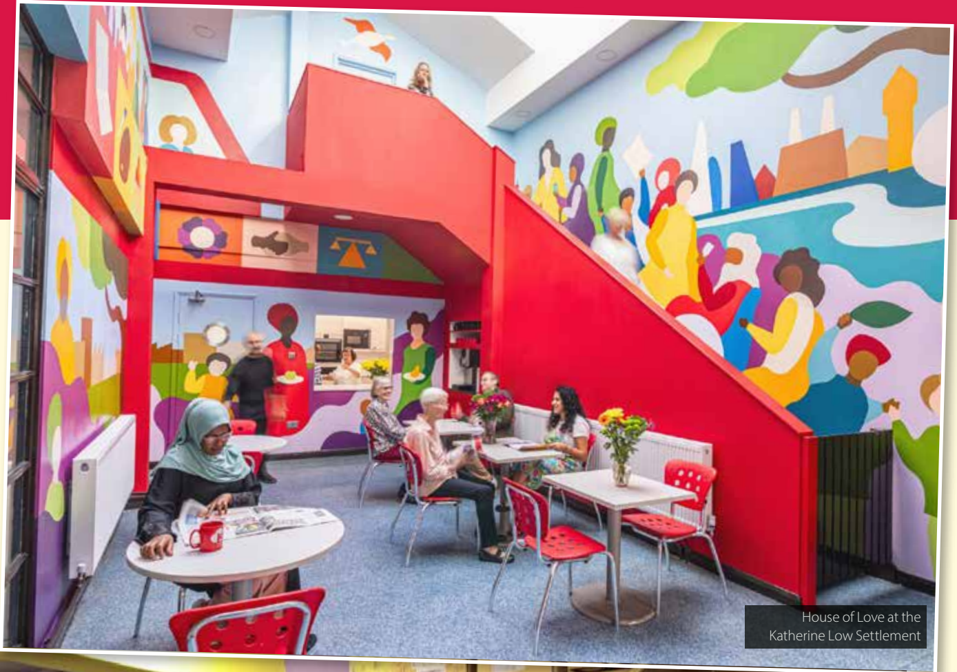
House of Love at the Katherine Low Settlement