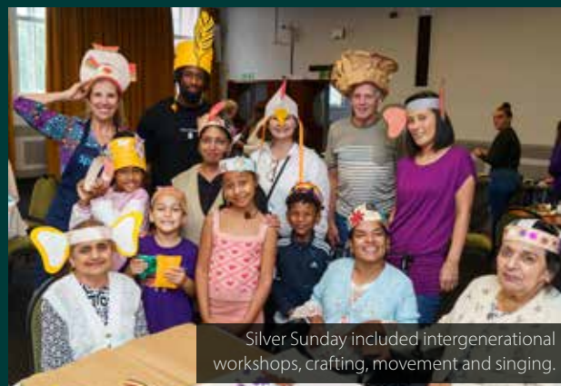
Silver Sunday included intergenerational workshops, crafting, movement and singing.