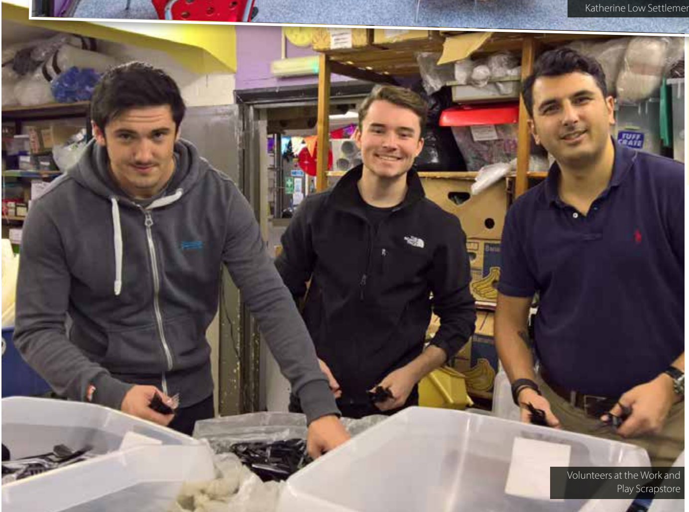
Volunteers at the Work and Play Scrapstore