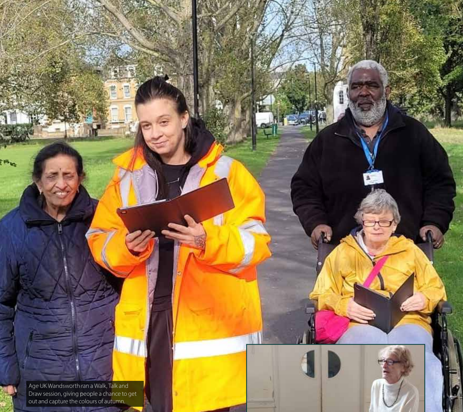
Age UK Wandsworth ran a Walk, Talk and Draw session, giving people a chance to get out and capture the colours of autumn.