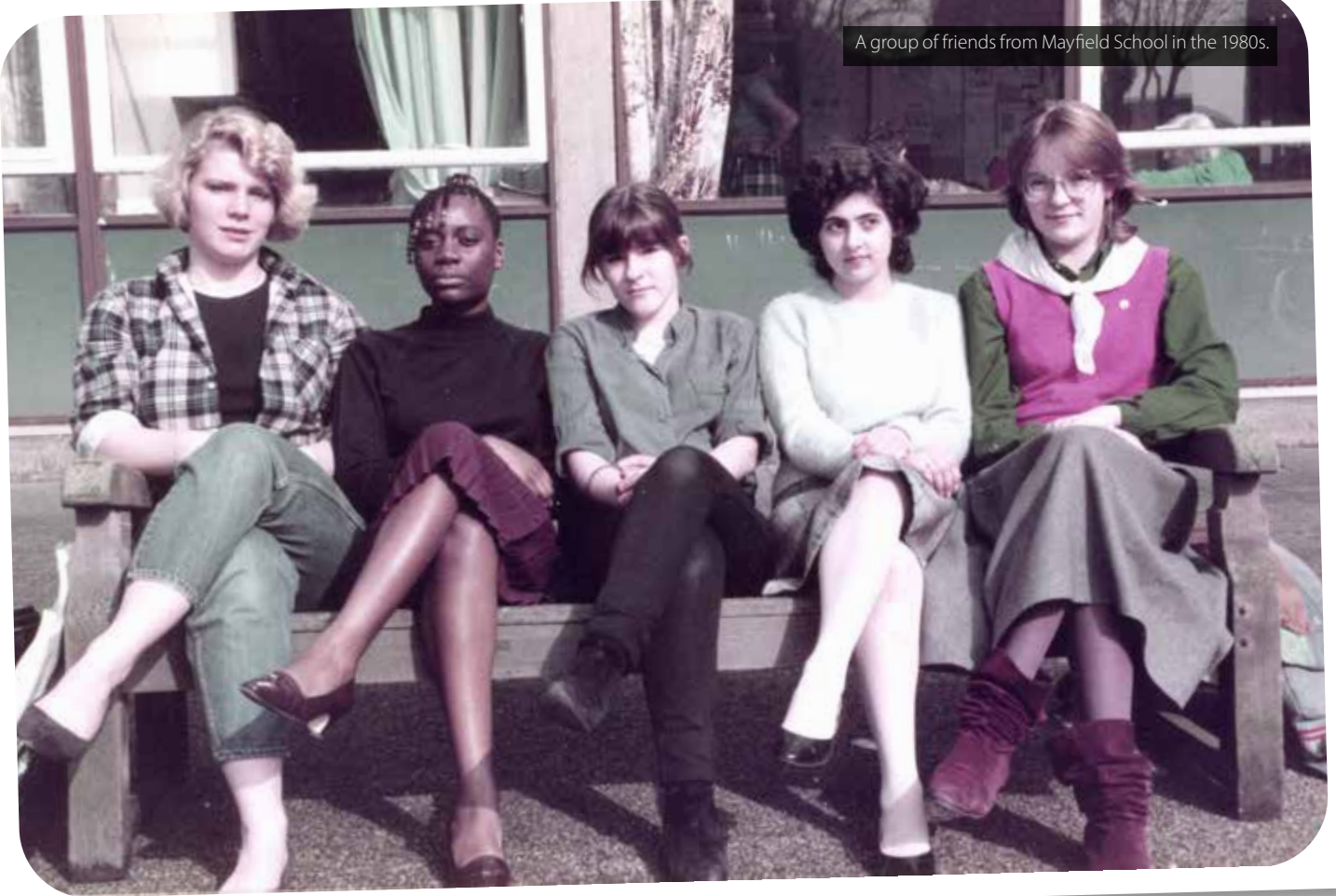
A group of friends from Mayfield School in the 1980s.