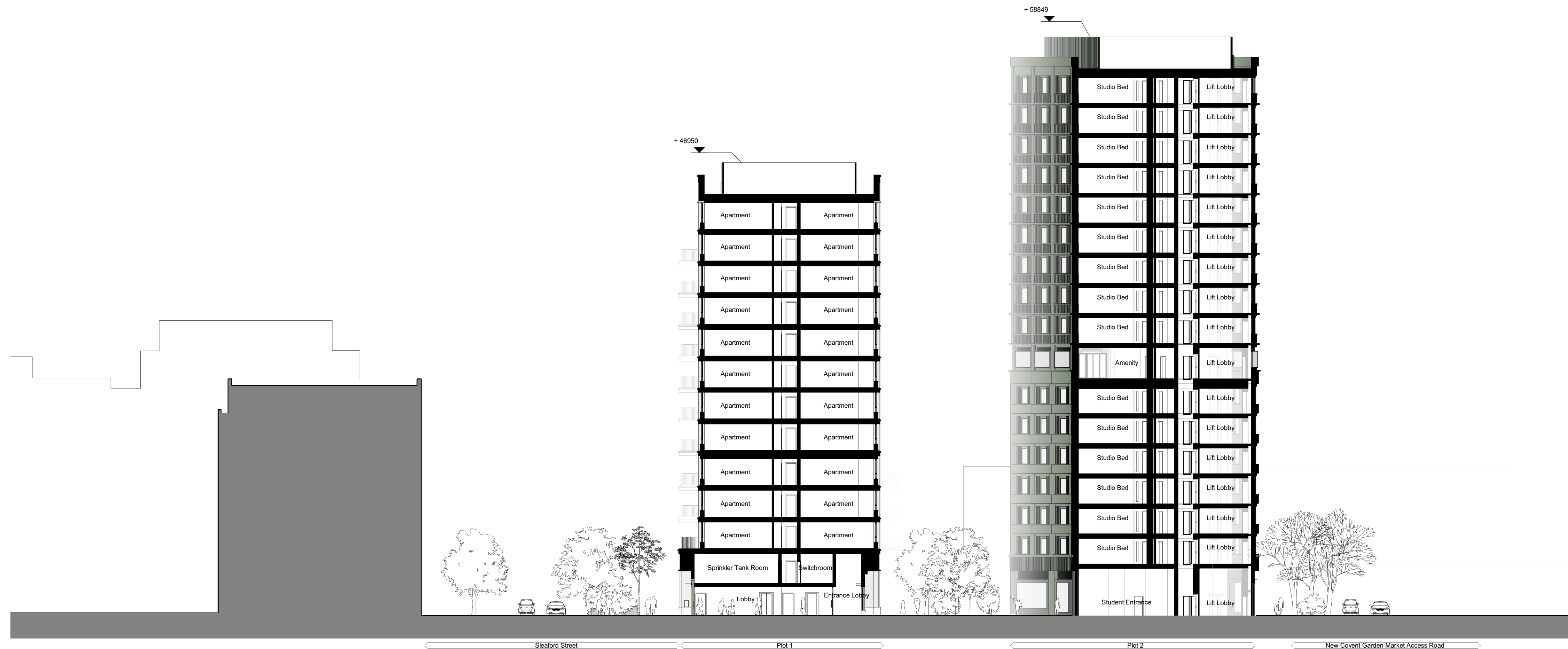
Plot 01 - Section A-A 1 : 250

Notes & Key: HWS Ref: 2278 Dimensions are not to be scaled from on this document. Notify Howells of discrepancies affecting the information shown. This drawing is copyright of Howells, the trading name of Glenn Howells Architects Limited.