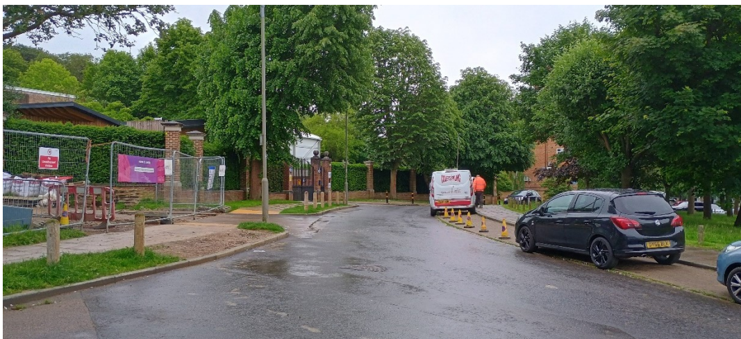
The proposed location of the bays to be suspended.

A part of the approved scheme, a new cross over has been formed to allow site traffic to access site and will eventually form part of the new access road to the new development. To further assist the safe access and egress in and out of site during the works, and agreed with Wandsworth Area team, 3 parking bays will be temporarily suspended for approximately 4 months whilst the heavy earth moving works are being completed. These 3 parking bays will be directly opposite the new cross over and signs will be installed to give notice of these suspensions.