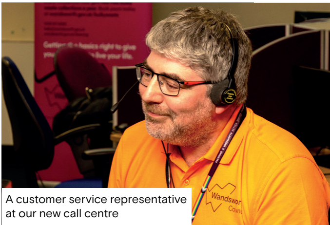
A customer service representative at our new call centre