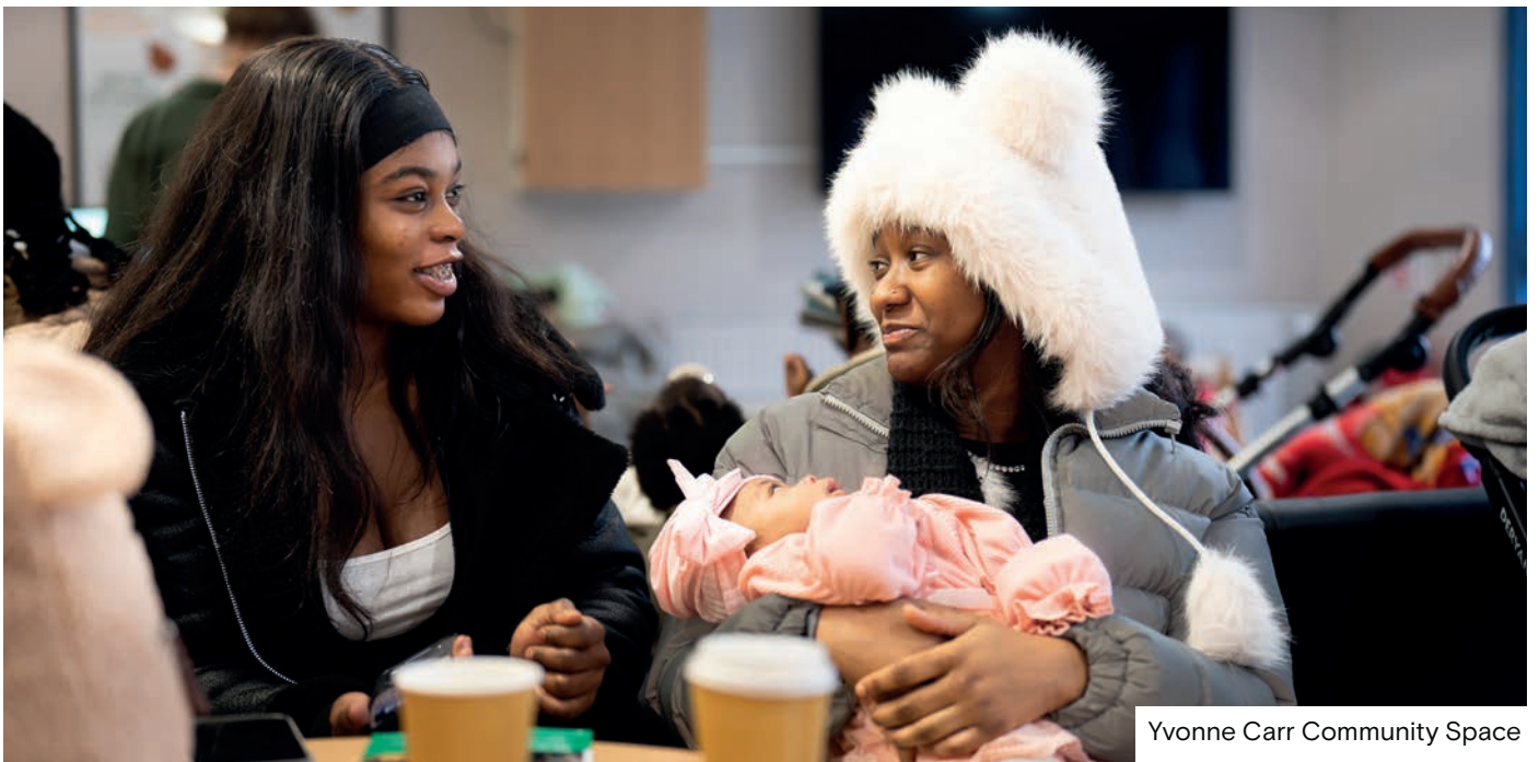
Yvonne Carr Community Space