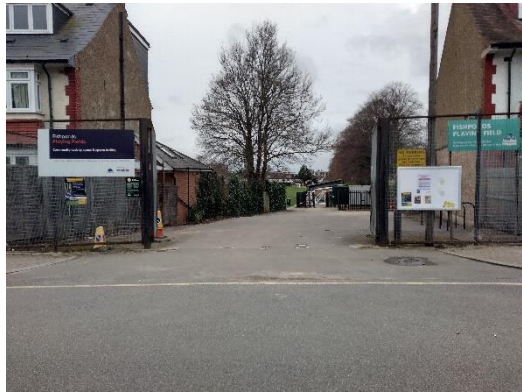
Main Entrance to site