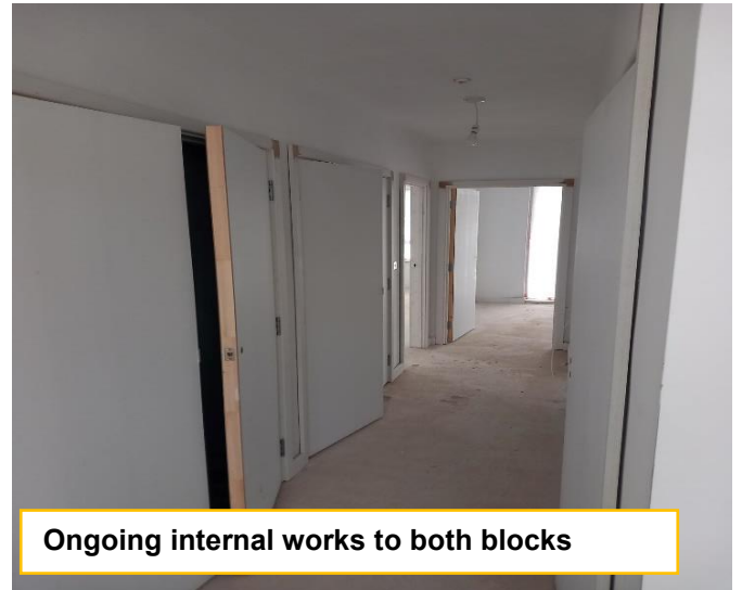
Ongoing internal works to both blocks

Externally, the water connection is now complete. The scaffolding is starting to be dismantled and the cleaning of the building elevation will commence. Lastly, the crane is due to be dismantled this coming week.