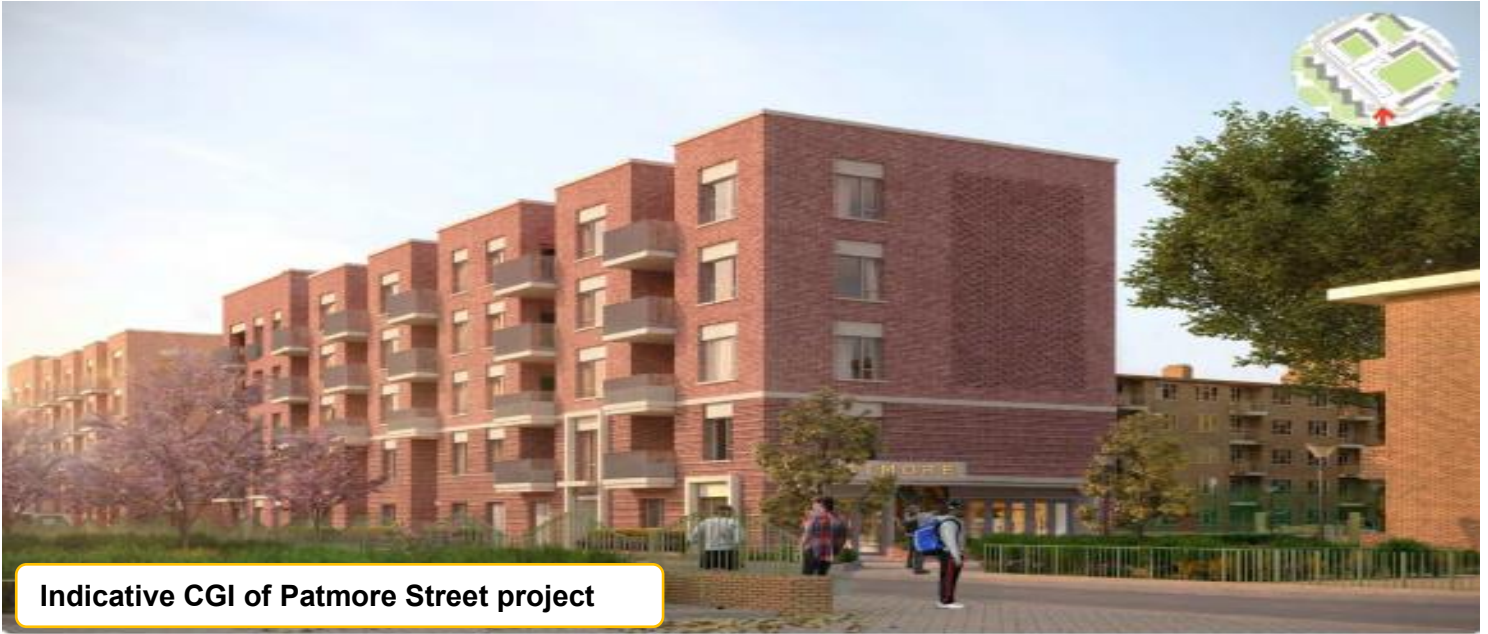
Indicative CGI of Patmore Street project