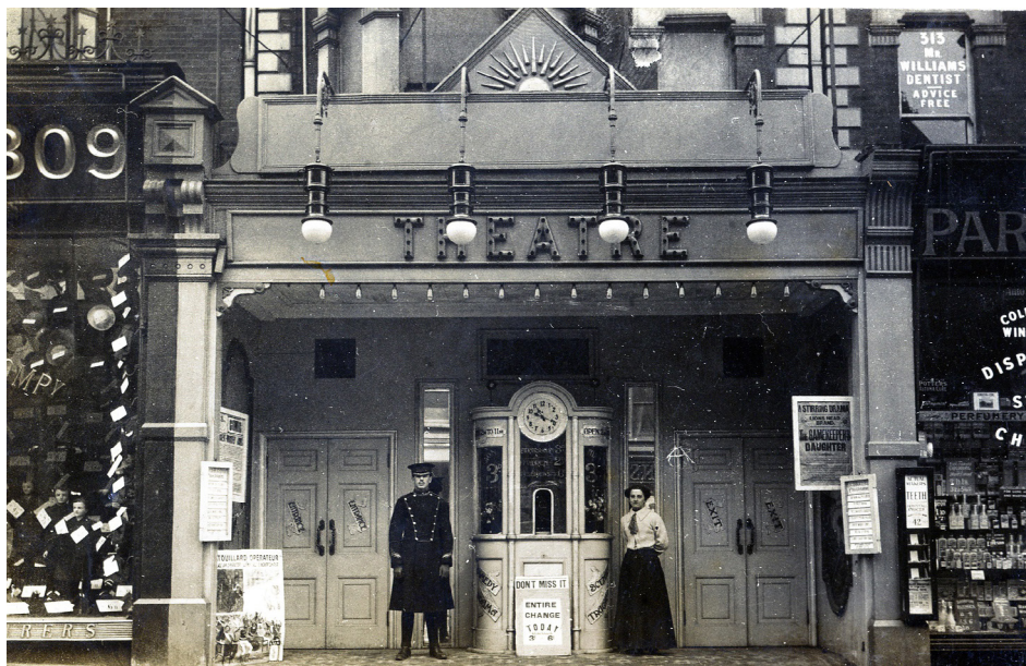
The Junction Cinema Battersea