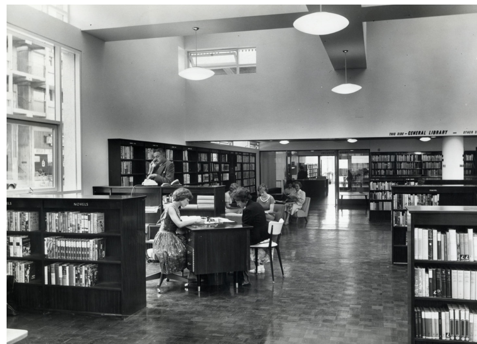
Readers in Roehampton Library, 1961