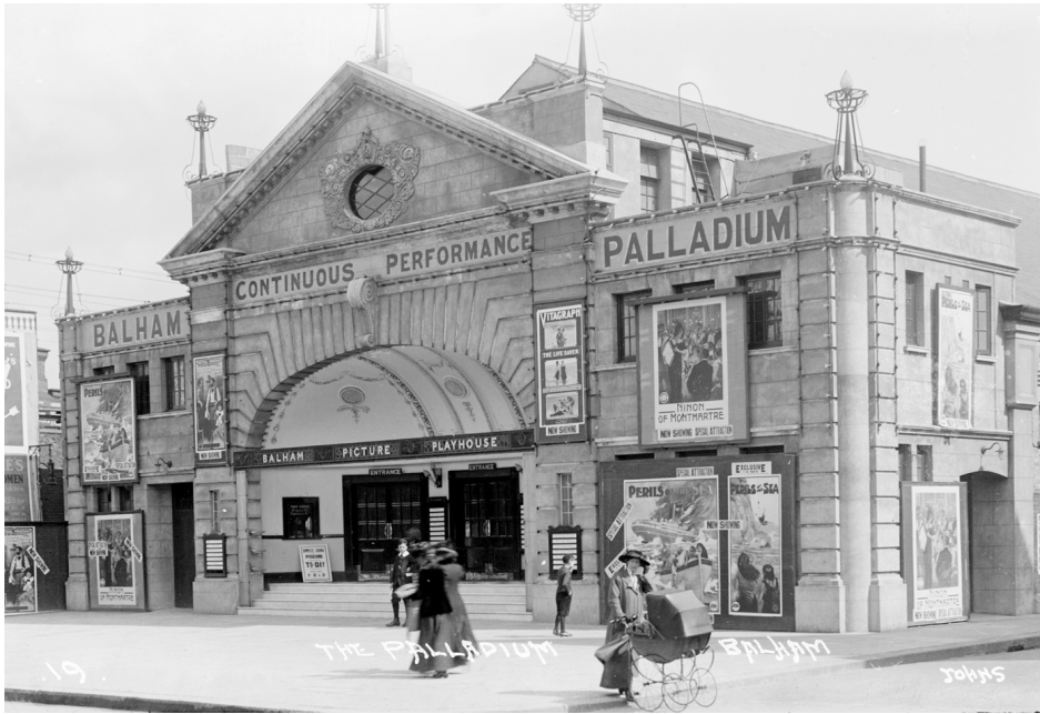
Balham Picture Playhouse, c1910s