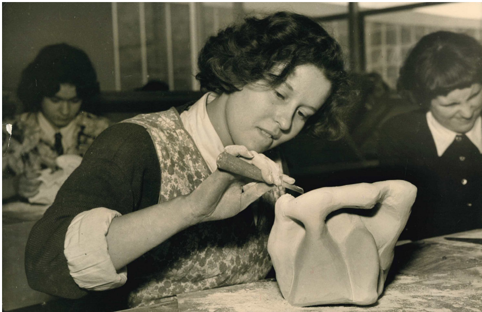
Mayfield School pupil sculpting, c1970s