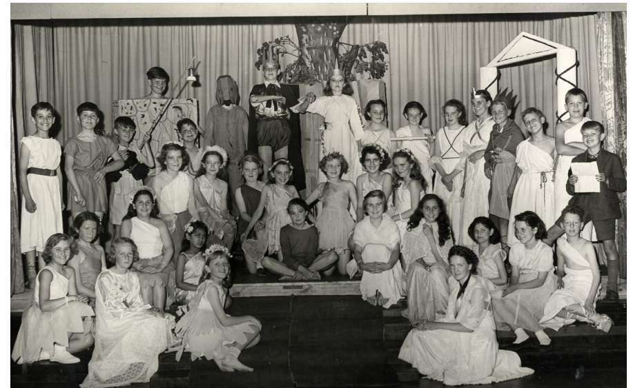
School play performed at West Hill, c1970s