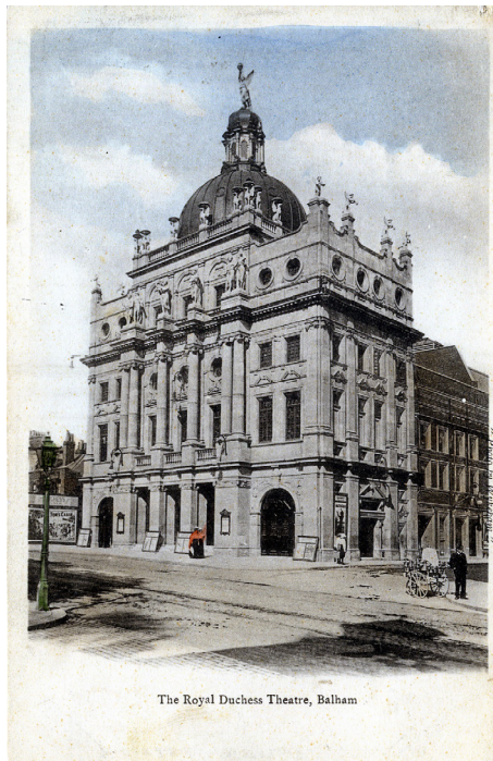
The Royal Duchess Theatre, Balham