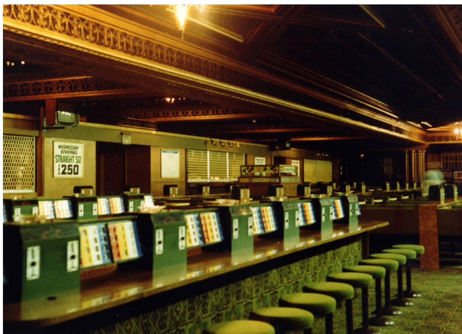
Bingo machines in former Granada Cinema, Tooting, c1990