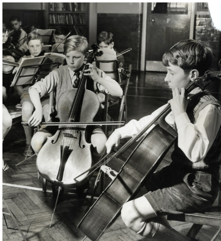
Franciscan Junior School orchestra, c1970s