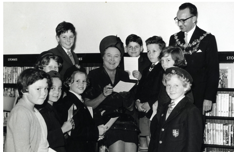
Noel Streatfeild with young library patrons and the Mayor of Wandsworth at the opening of Roehampton Library, 1961