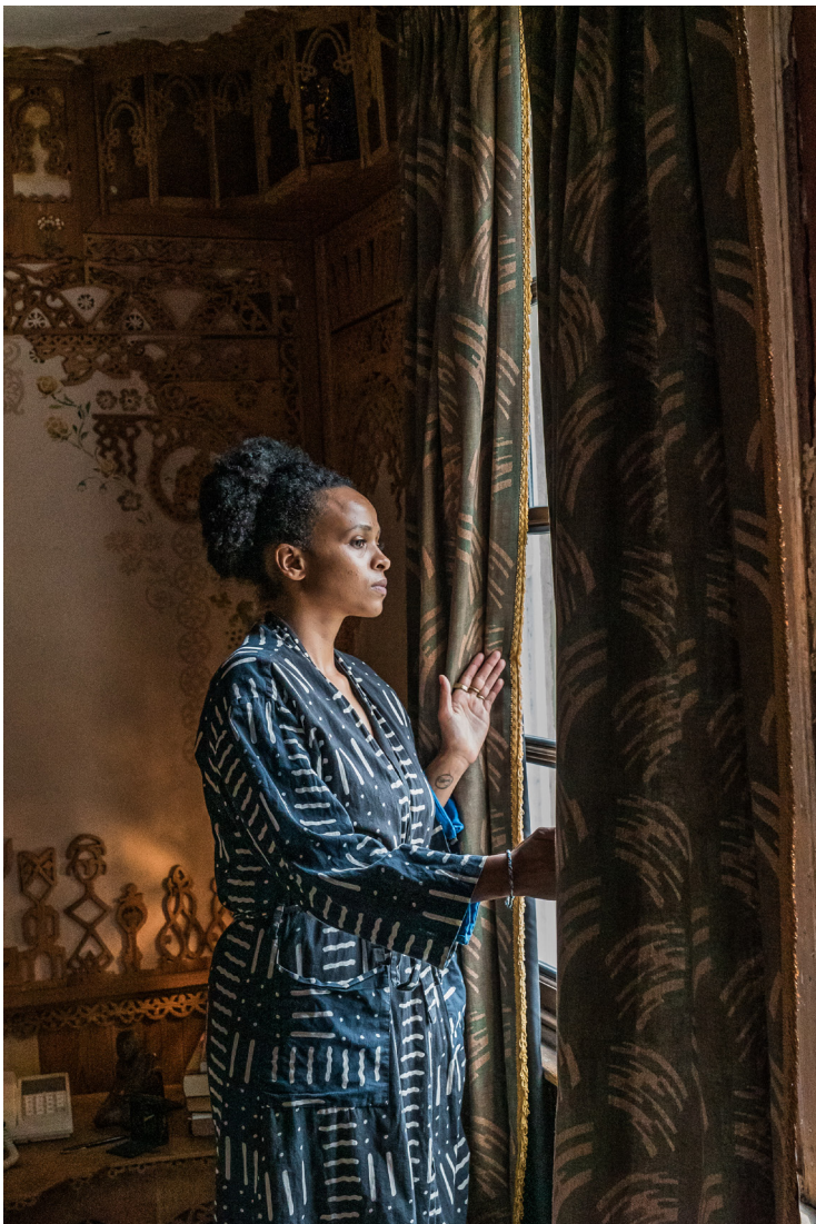
Back cover: From Wandsworth Fringe performance, The Visit - 575 Wandsworth Road, 2023

We aim to ensure the information provided is correct at the time of going to print but there may be unavoidable last-minute changes in events. Any changes will be posted in libraries, our website: better.org.uk/library/london/wandsworth/wandsworth-heritage-service and on X: @wandsworthlibs