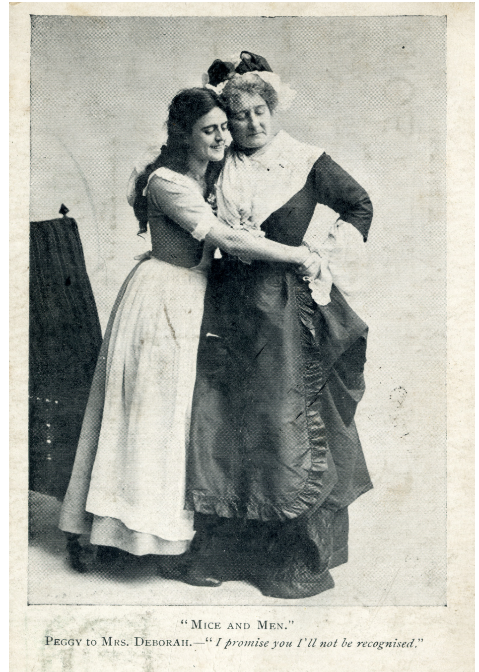
“MICE AND MEN.” PEGGY to MRS. DEBORAH.—“ I promise you I’ll not be recognised. ”