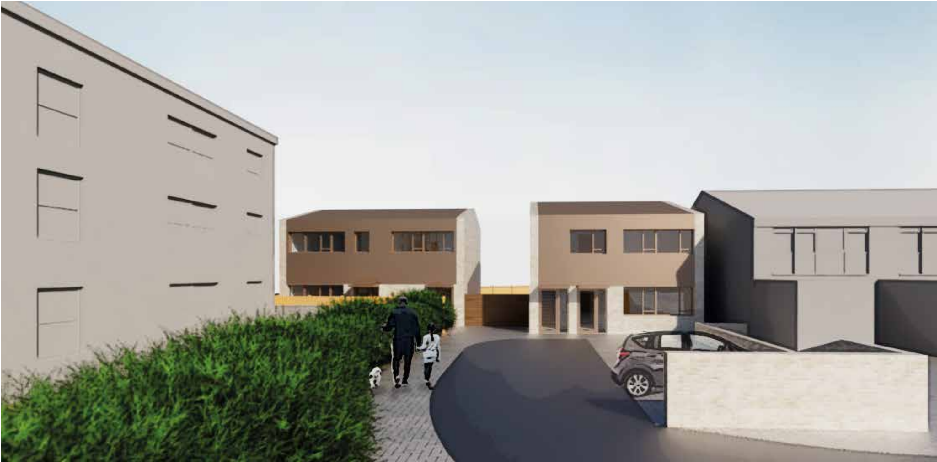
View of front elevation looking from Arnal Crescent towards new building.