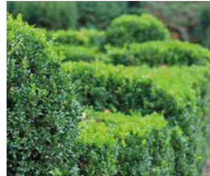
Soft landscaping example