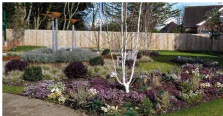
Communal garden ideas example.