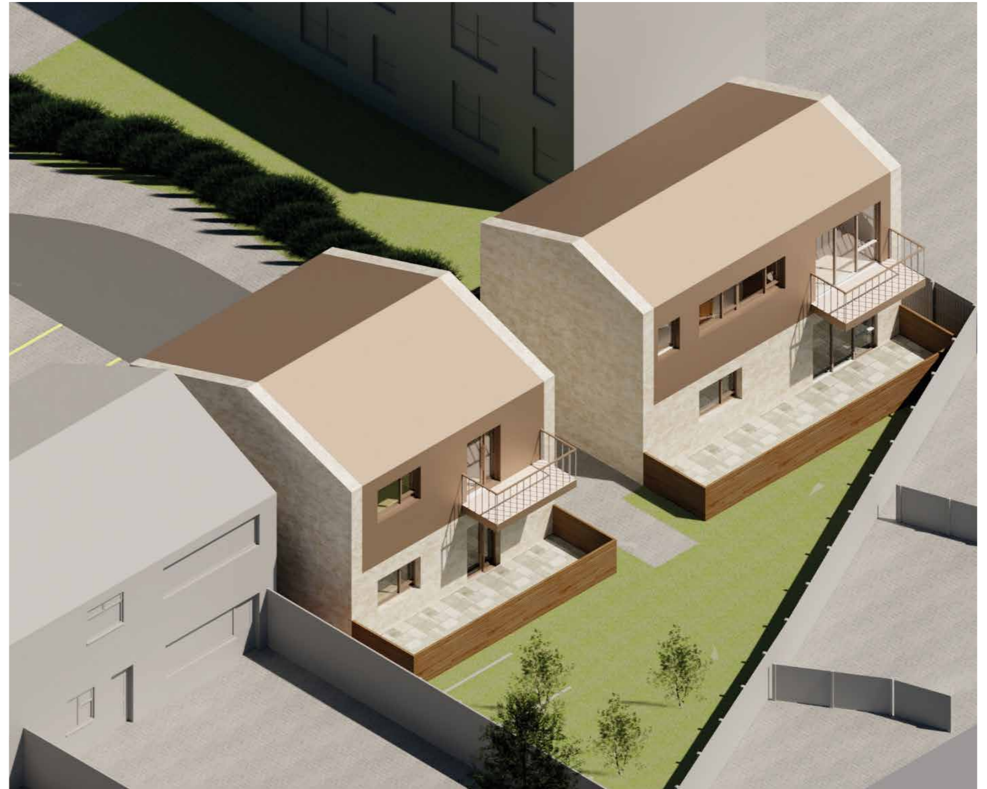
View looking from the proposed communal garden to rear of new development.