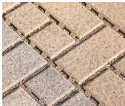
Hard landscaping example