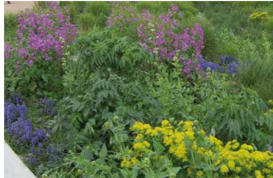
Soft landscaping example