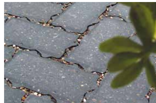
Hard landscaping example