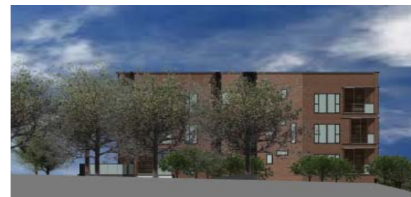
Proposed West Elevation - NTS