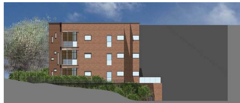
Proposed South Elevation facing Whitlock Drive

156 - 232 Whitlock Drive, Wandsworth, SW19 6SW