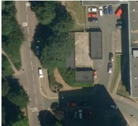
Aerial Plan - Not To Scale (NTS)