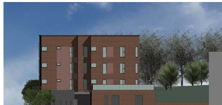
Proposed East Elevation facing the existing parking area and block of flats