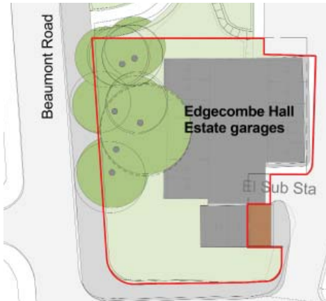
Site Location Plan - Not To Scale (NTS)