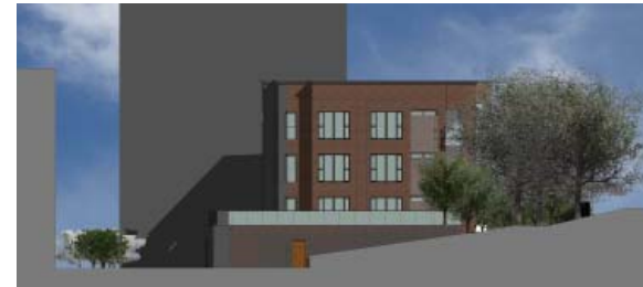
Proposed North Elevation - NTS