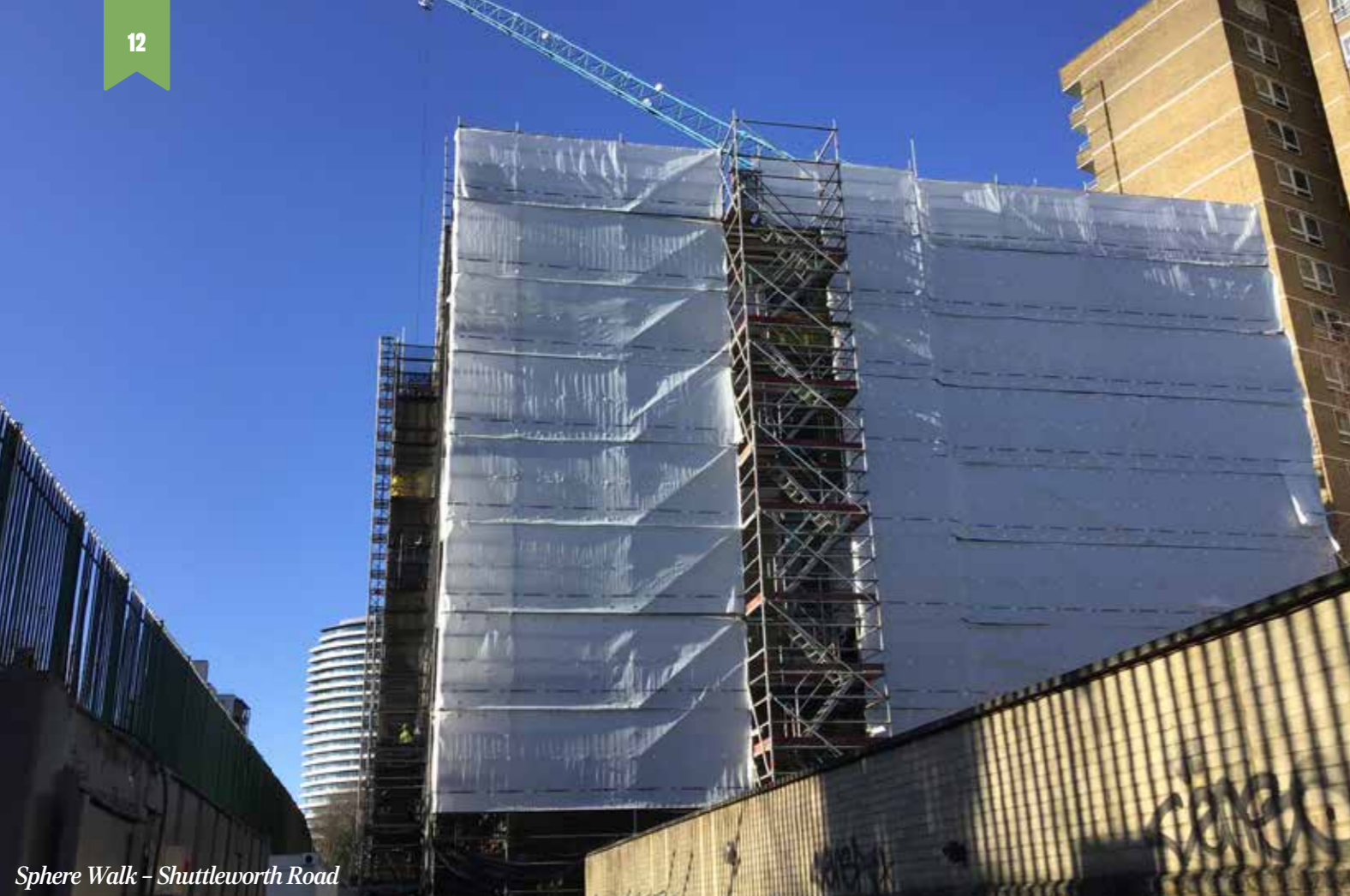
Sphere Walk – Shuttleworth Road