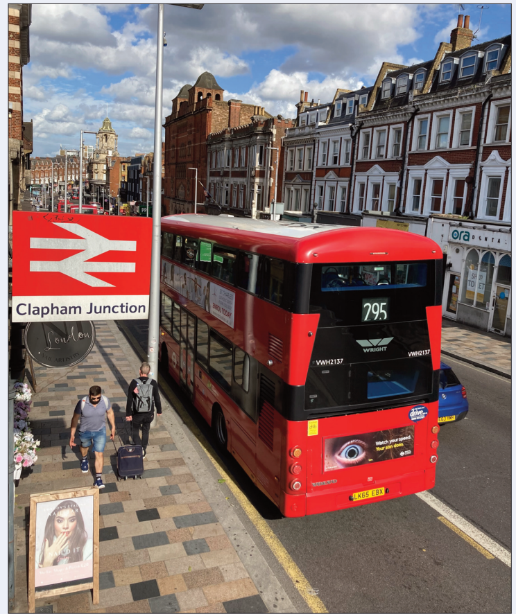
The Winstanley and York Road Regeneration Area will deliver up to 2,550 new homes supported by a new park and a leisure centre. This Area Strategy supports the masterplan for the area.

Despite its excellent public transport connections, the area suffers from significant through-traffic, especially east-west on the Lavender Hill - St John's Hill and Battersea Rise corridors. There are a lack of foot/cycle connections within the centre, and to adjacent locations, such as the Thames riverside and to the Winstanley and York Road Estates.