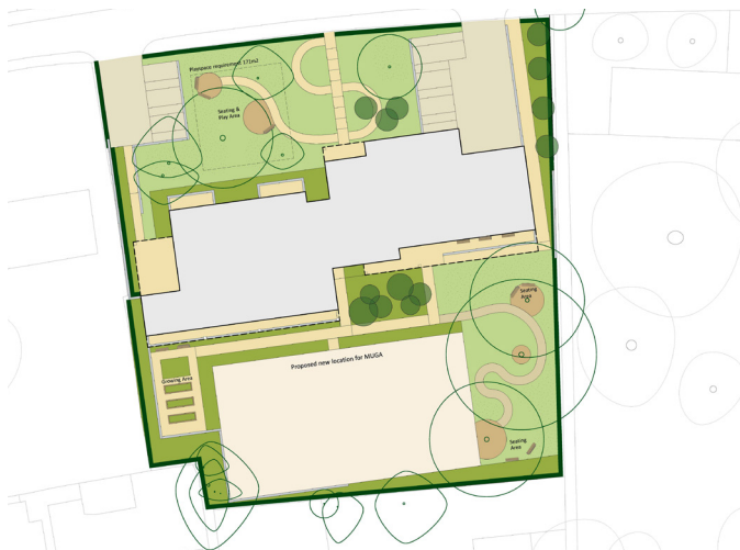
Proposed Ashburton Youth Centre Landscaping

The proposed landscaping approach has carefully considered and responded to the site context and will