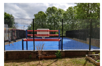
Ashburton Youth Centre today