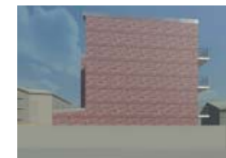
Proposed Front and North View