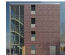
Proposed Rear and South View