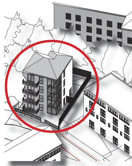
Proposed Aerial Front View