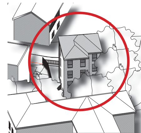
Proposed Aerial Rear View