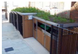
Proposed bin stores