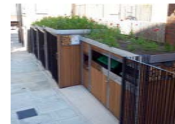
Proposed long stay cycle spaces