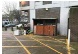
Existing bin stores