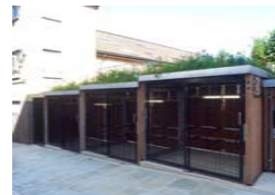
Proposed long stay cycle spaces