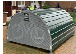
R.A. agreed bike store