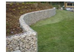
Precedent green spaces