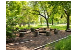
Precedent green spaces