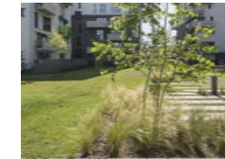
Precedent green spaces