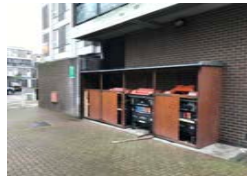
Existing bin stores