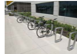
Proposed short stay cycle spaces