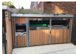
Proposed bin stores