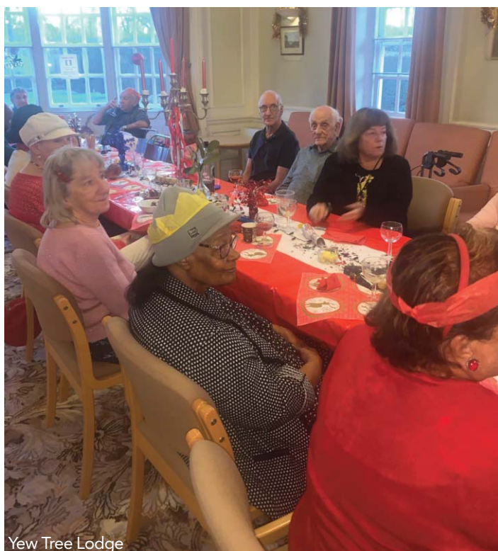
Yew Tree Lodge