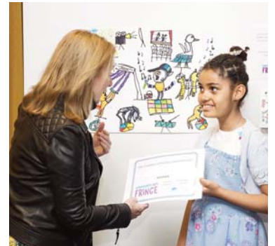
Last year's winner

For inspiration and to find out more about WAF, visit wandsworthartsfringe.com .