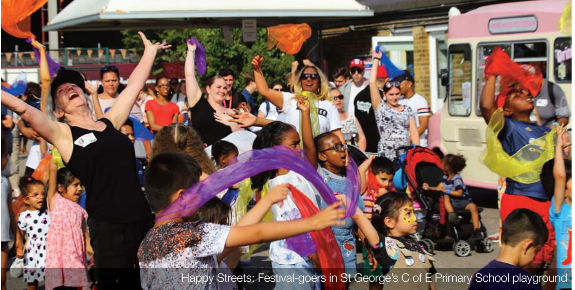
Happy Streets: Festival-goers in St George's C of E Primary School playground