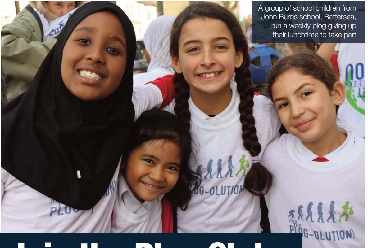
A group of school children from John Burns school, Battersea, run a weekly plog giving up their lunchtime to take part