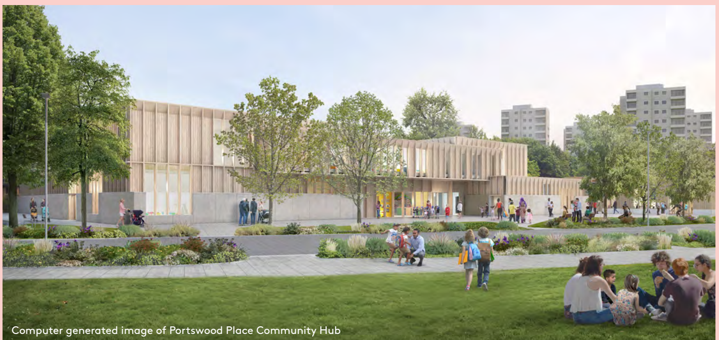
Computer generated image of Portswood Place Community Hub