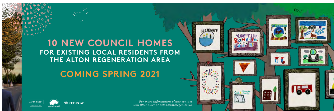
Bessborough Road hoarding