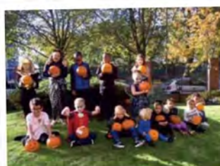
Totteridge kids show off their pumpkins