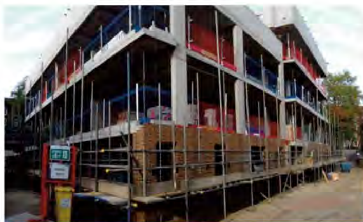
Building work on the Stewarts Road site has reached two storeys

The homes are to be named after local First World War heroes who were awarded the Victoria Cross. (See page 11)