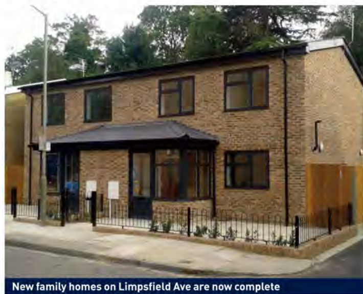
New family homes on Limpsfield Ave are now complete