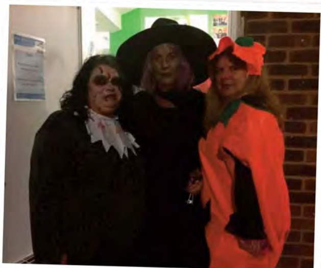
Fancy dress at Kambala