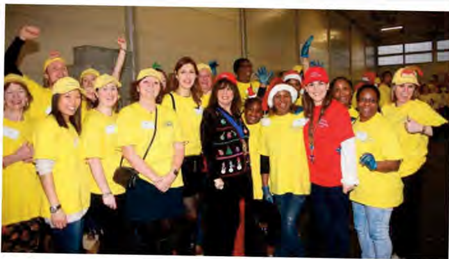
Volunteers having fun at last year's party