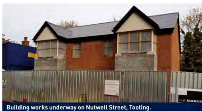
Building works underway on Nutwell Street, Tooting.