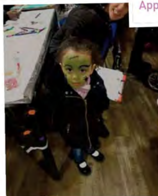
Face painting at Battersea Fields