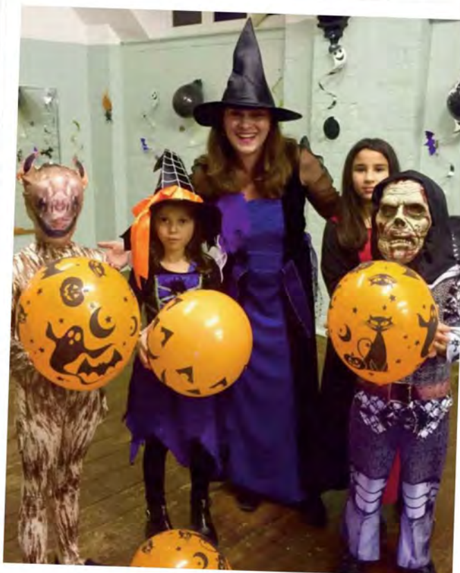
Women of Wandsworth's Halloween party