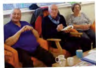
Lennox residents enjoying their cake

The event is a chance to ensure no one is alone this Christmas. If you'd like to volunteer or refer a new guest (either yourself or someone you know) who would be otherwise alone on Christmas visit www.rotarychristmasday.org.uk