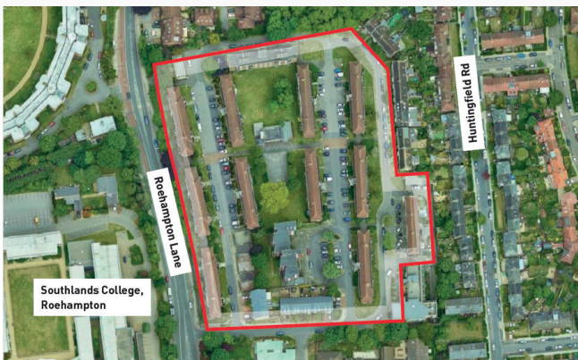
Image showing Aubyn Square Estate