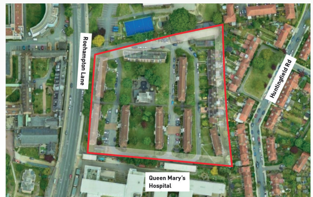
Image showing Toland Square Estate