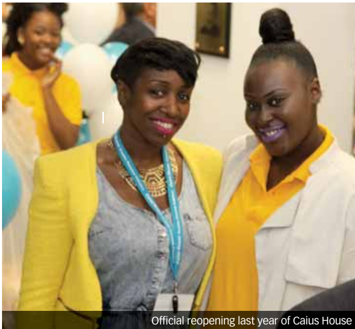
Official reopening last year of Caius House