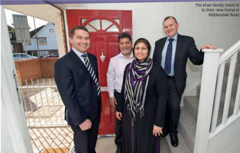
The Khan family move in to their new home in Ribblesdale Road