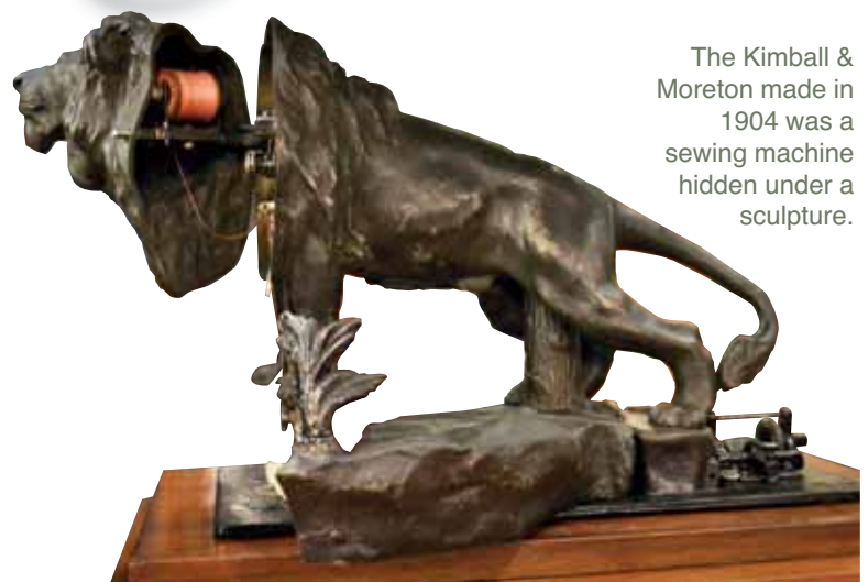
The Kimball & Moreton made in 1904 was a sewing machine hidden under a sculpture.

Highlights of the collection include the first ever Singer machine, a patent machine sent from America for the Great Exhibition and a unique machine originally owned by Queen Victoria's eldest daughter, Princess Vicky – mother to the future Kaiser Willhem II.