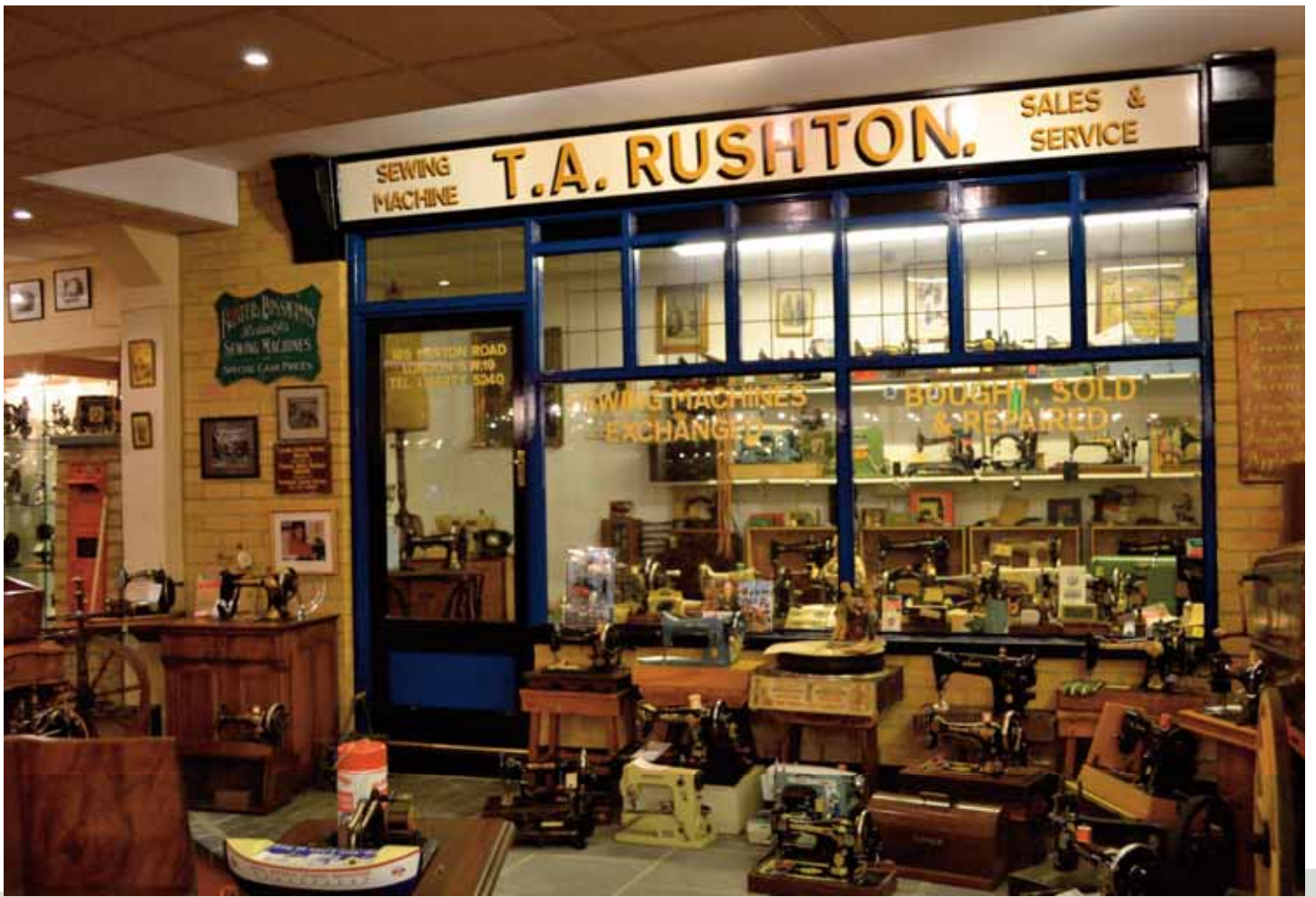
A recreation of the original Merton Road shop