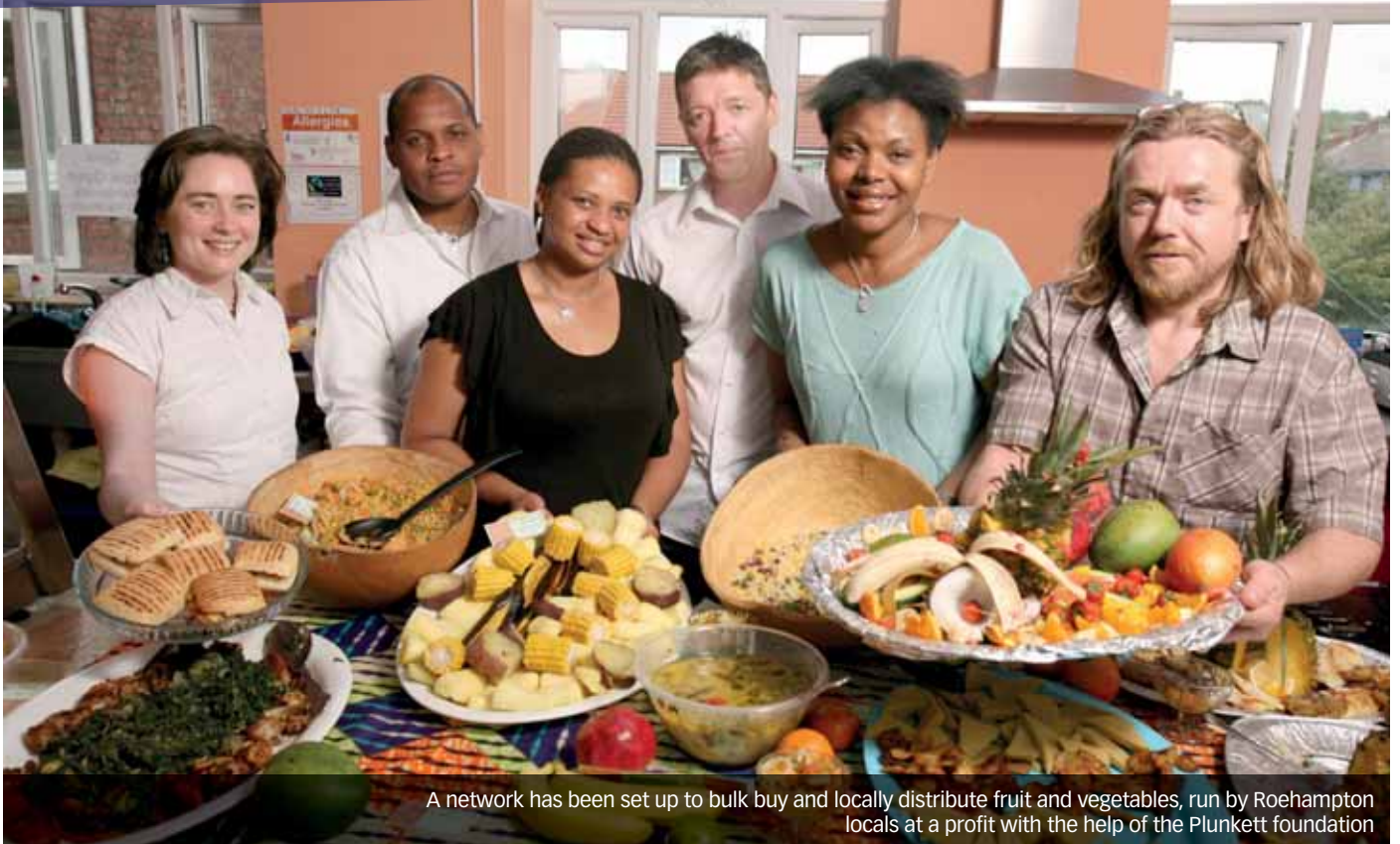
A network has been set up to bulk buy and locally distribute fruit and vegetables, run by Roehampton locals at a profit with the help of the Plunkett foundation