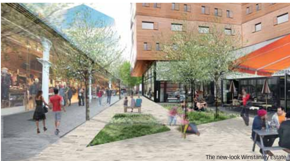
The new-look Winstanley Estate

The council's new housing strategy includes the 'Wandsworth Decent Homes Plus' investment programme which will see £77million spent on improving council housing over the next three years to keep it well above the national standards.