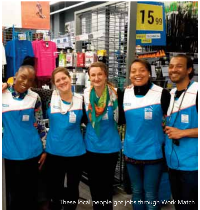
These local people got jobs through Work Match