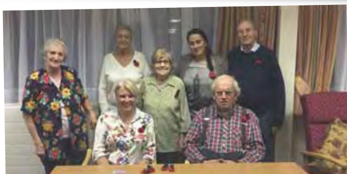
Residents from Francis Snary Lodge took part in a Poppy craft afternoon to mark Remembrance Day and raise money for the Poppy Appeal.