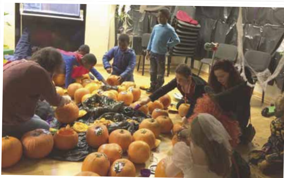
Residents of Totteridge House in Battersea threw a Halloween party for their neighbours. Children and adults alike enjoyed games and pumpkin carving. Thanks to the residents for their kind donations which made this event possible!