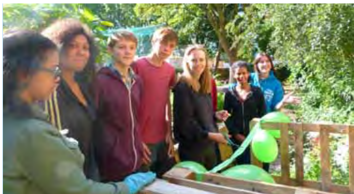
Wendelsworth garden gets a helping hand from volunteers