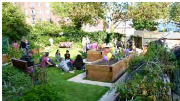
Residents enjoy their garden