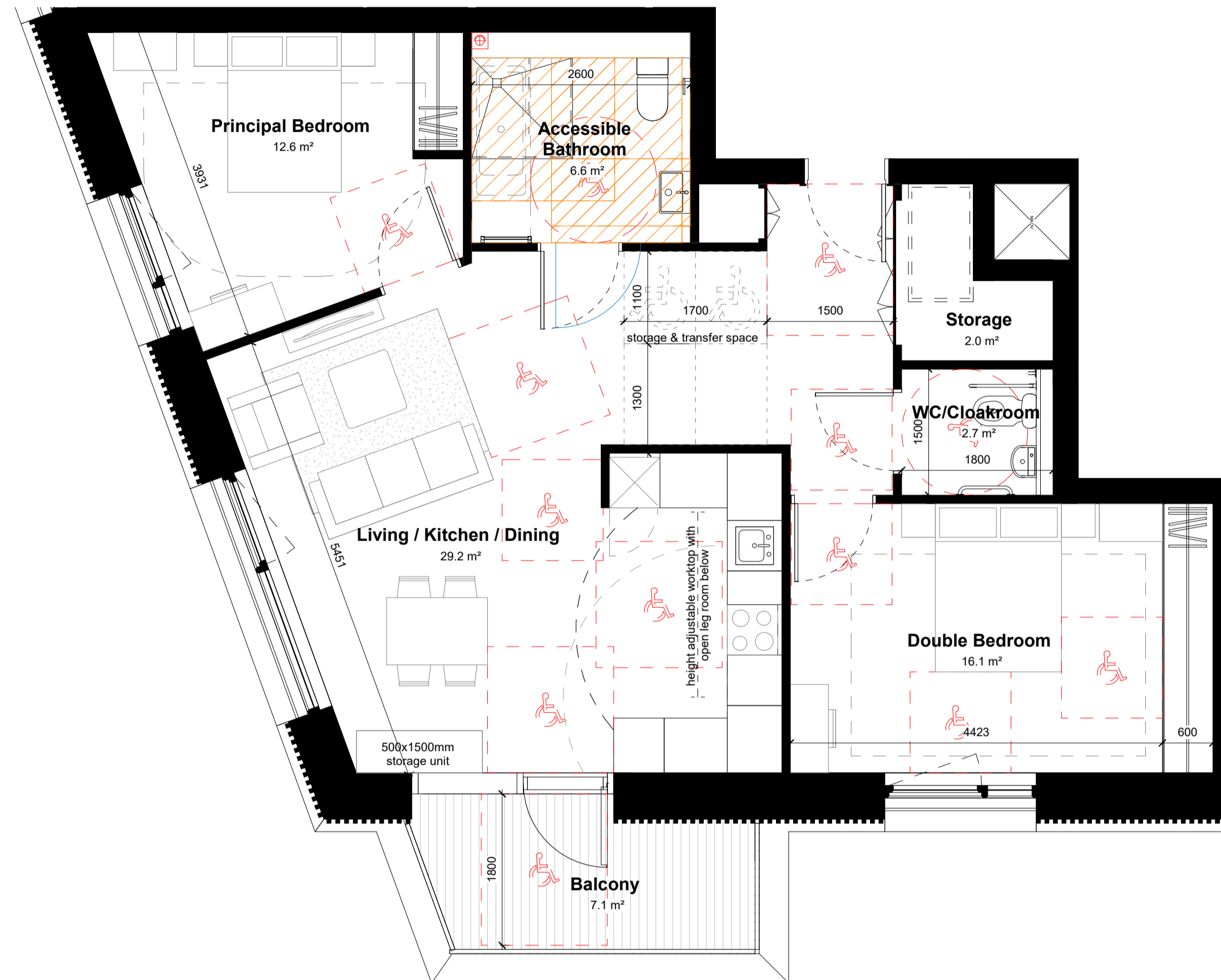
03 - 2 Bedroom 4 Person Wheelchair User Accessible Apartment Layout 1 : 50