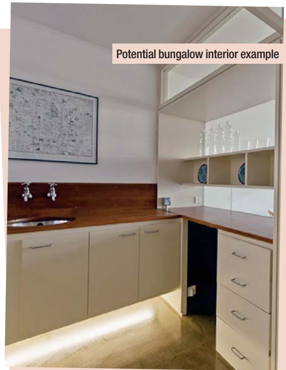
Potential bungalow interior example