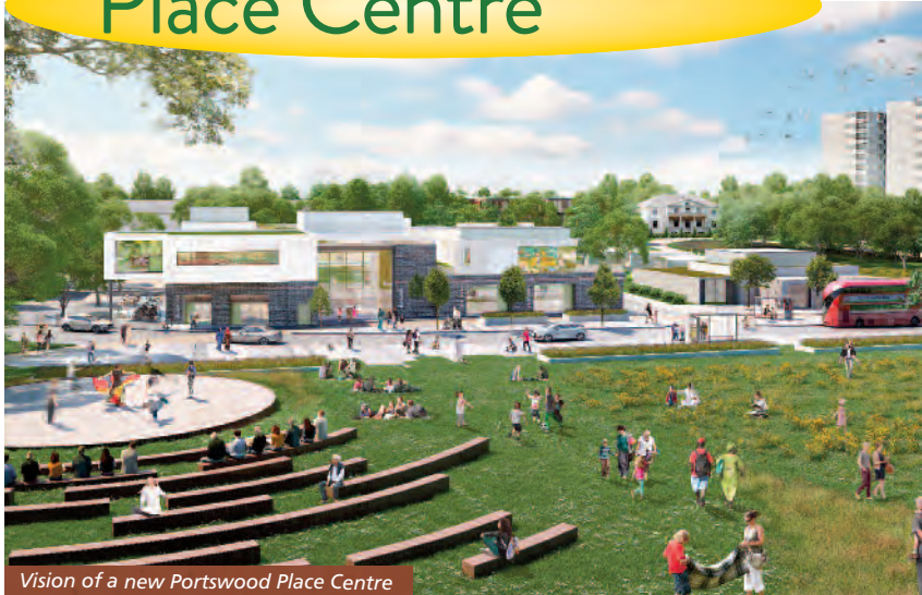
Vision of a new Portswood Place Centre

The redevelopment of Portswood Place will see the area transformed and play more of a significant role in residents' lives.