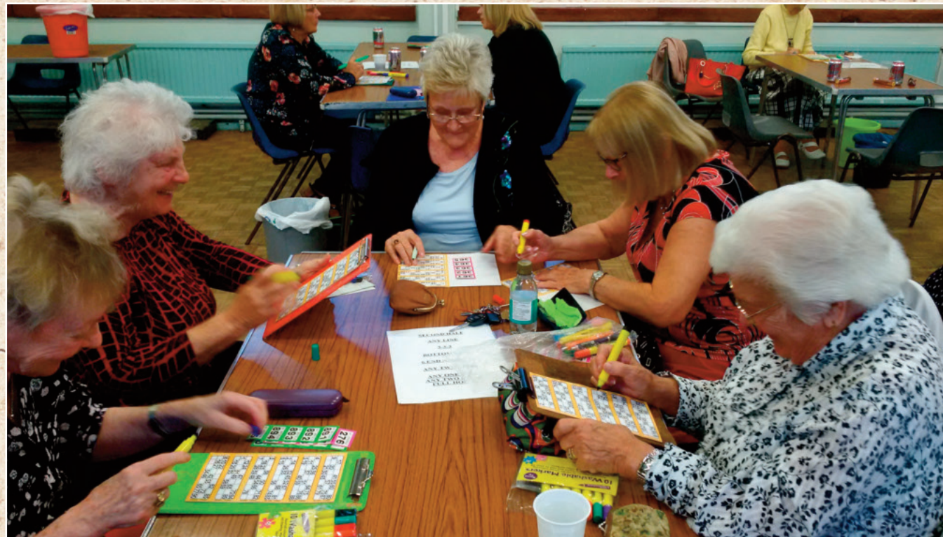
Regulars enjoying a night of bingo