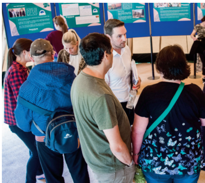
Discussing the regeneration

Older people from the area enjoyed a cream tea in the shelter of a marquee, alongside an exhibition from Wandsworth U3A on Roehampton locals who went off to fight in the First World War.