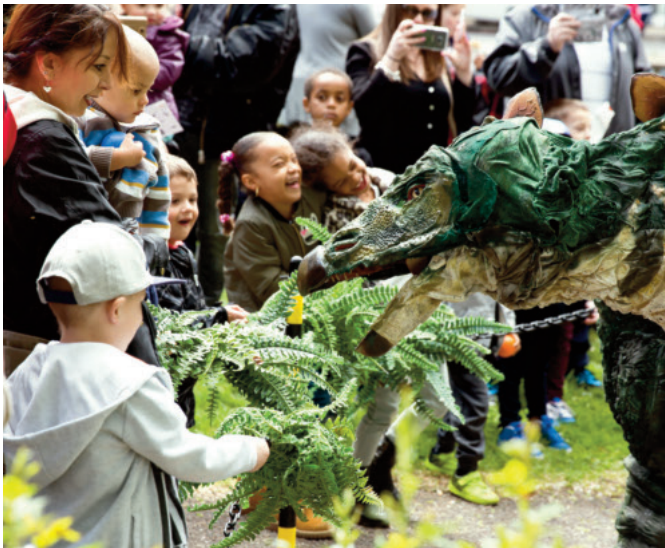
A previous ROAM event