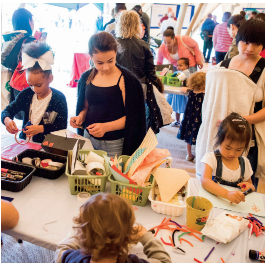
Redrow Homes activities at the Feel Good Festival (more overleaf)