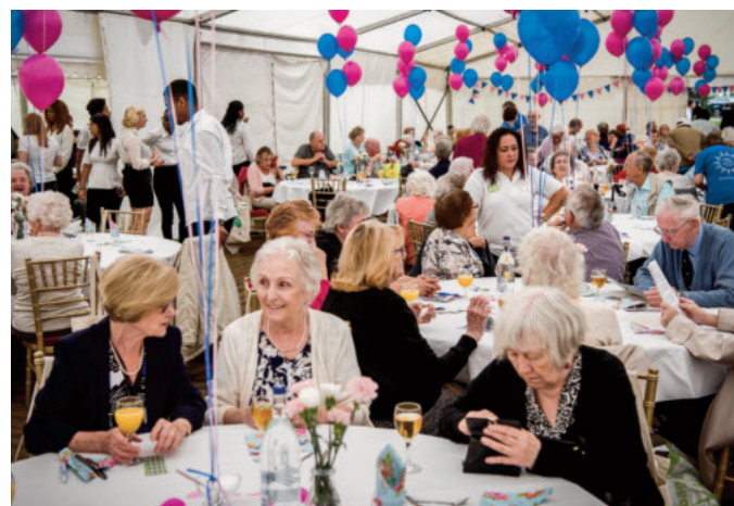
Cream tea organised by Regenerate: RISE and staffed by volunteers

A tepee from Redrow Homes, the council's partner for the regeneration of the Alton estate, featured information on how to get involved during September in consultation on the draft proposals, which are based on the Alton Area Masterplan.