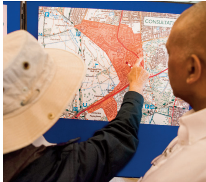
Consultation begins in September