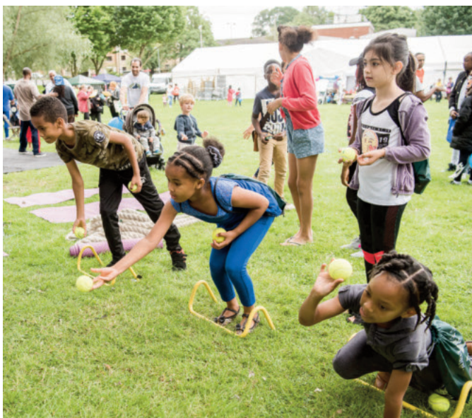
Roehampton Club activities