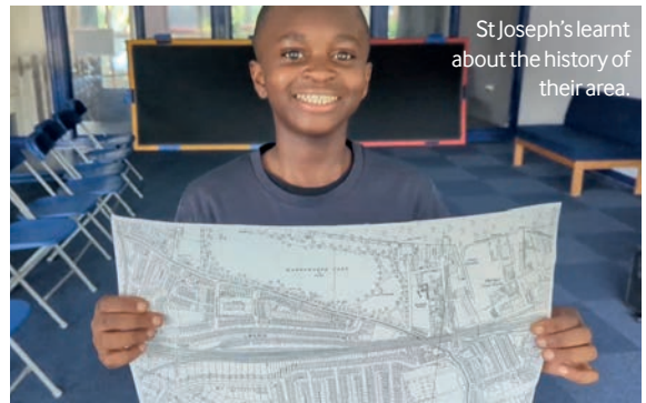
St Joseph's learnt about the history of their area.

Inspired to find out more, they investigated Wandsworth's past in their short film, and paid a