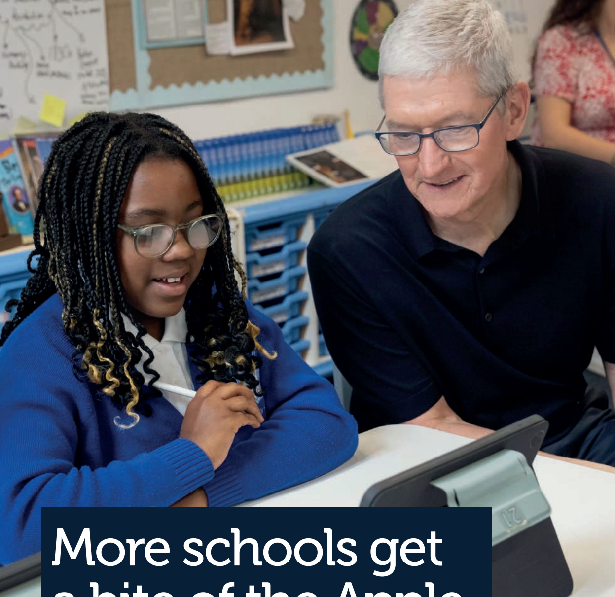
Tim Cook visits St Mary's