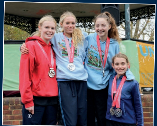
The girls' volleyball team

Find out more about this year's results and how to take part next year at enablelc.org/lyg