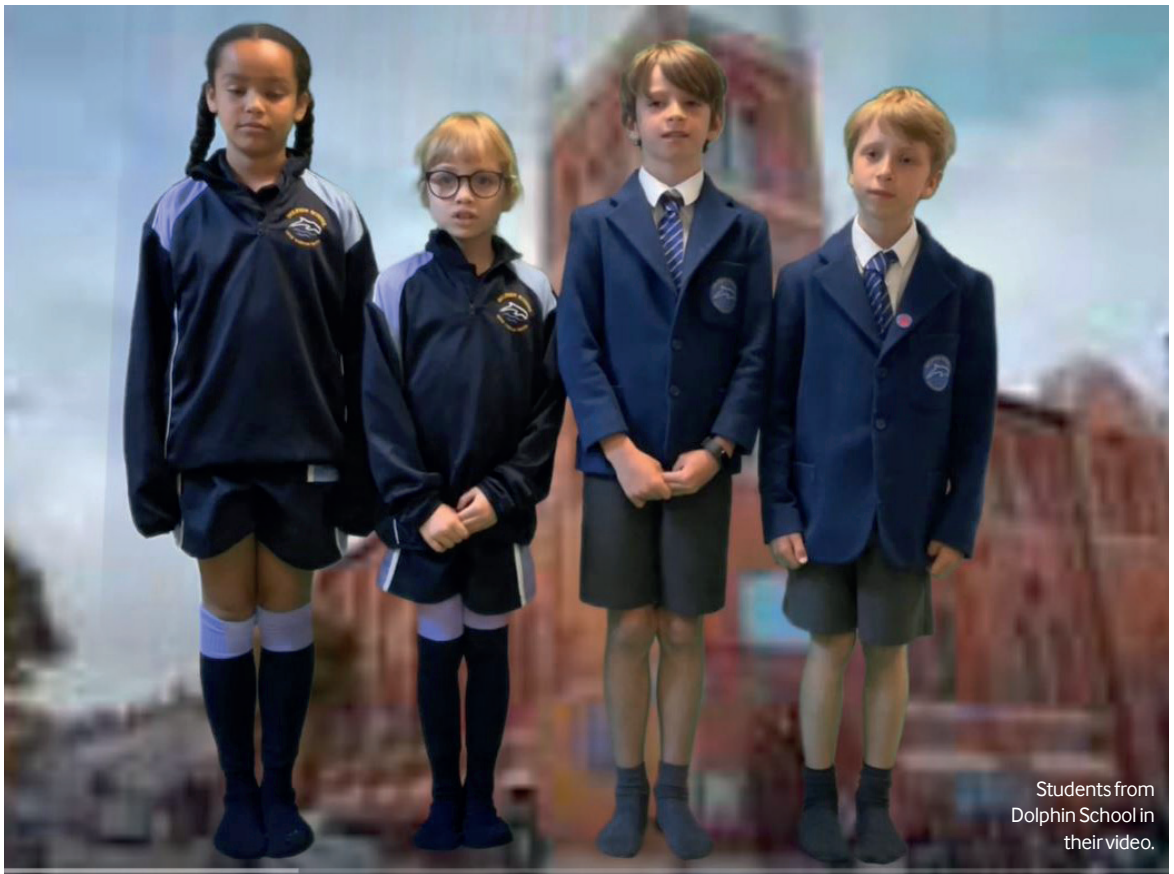
Students from Dolphin School in their video.

Both schools were awarded a prize, which included a £100 Amazon voucher, a free trampoline session, and an annual membership to the Wandsworth Historical Society.