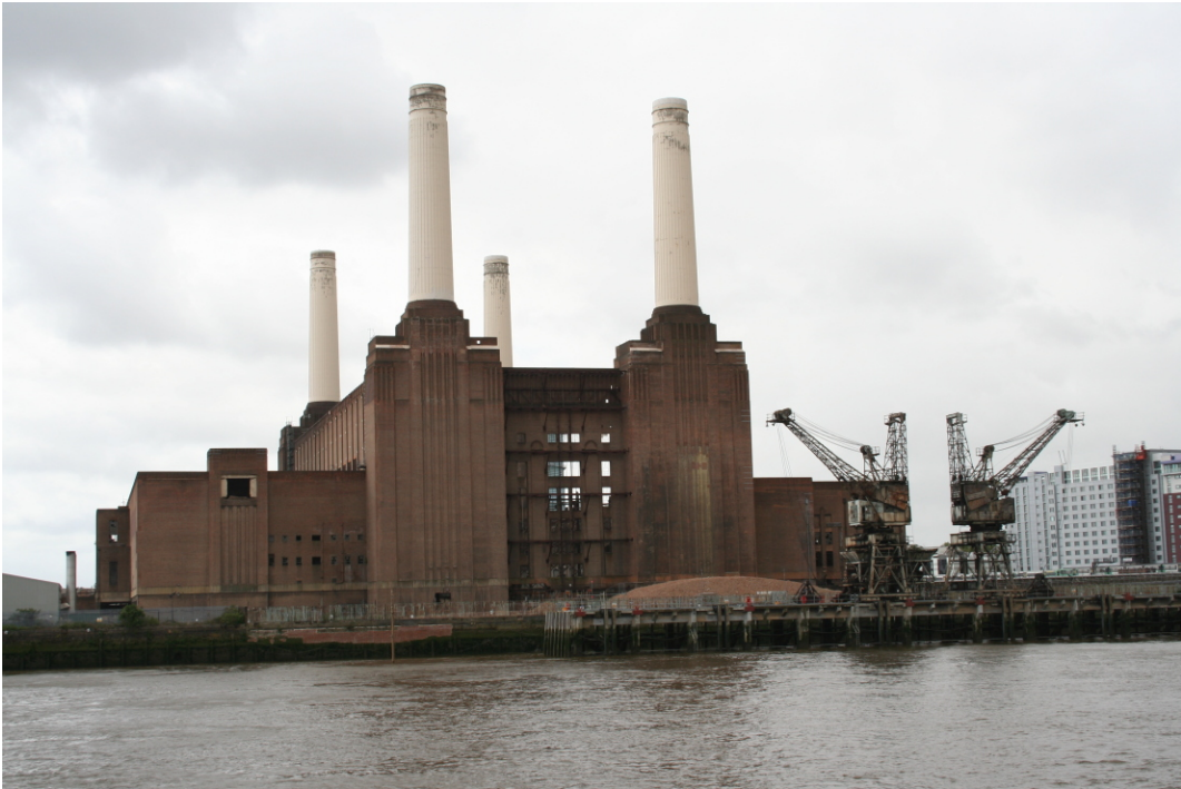
Picture 8.8 Battersea Power Station, Kirtling Street, SW8 (grade II*)