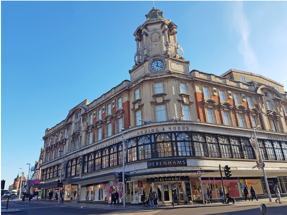
Picture 8.12 Debenhams (former Arding & Hobbs) Department Store, Lavender Hill, SW11 (grade II)