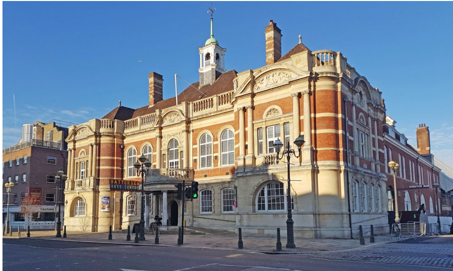
Picture 8.10 Battersea Arts Centre (former Battersea Town Hall), Lavender Hill, SW11 (grade II)