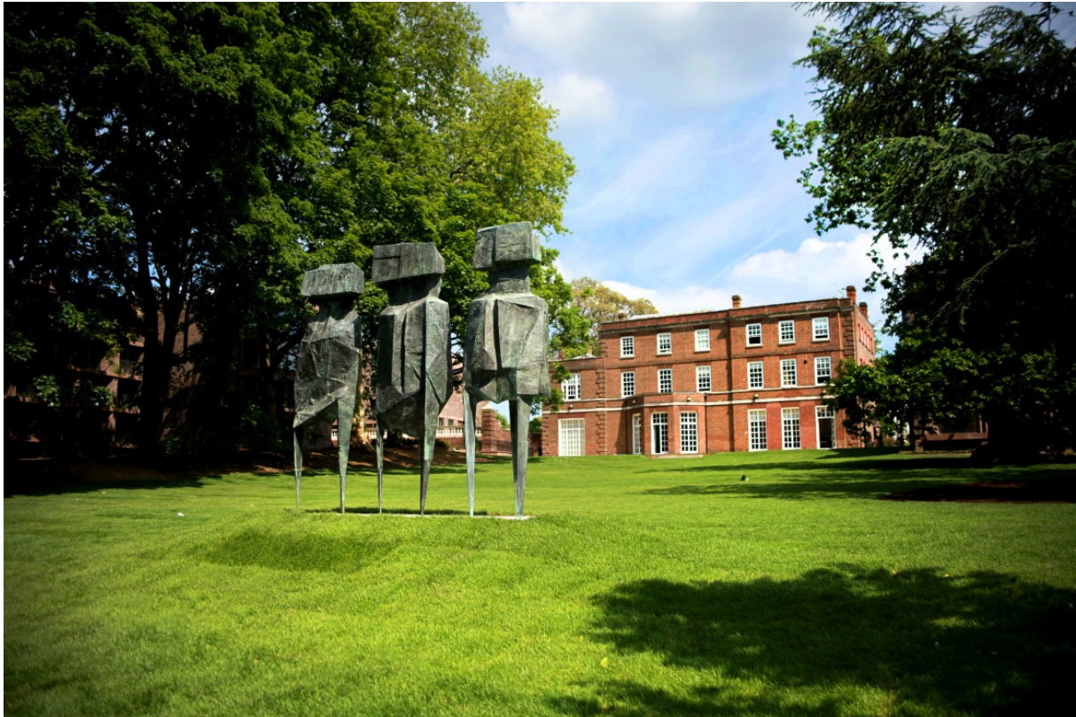
Picture 13.1 The Watchers, Downshire House, SW15

and expansion of Roehampton University new student accommodation has been provided at Downshire House. As part of the planning requirements the third Watcher was recast and the statue was restored to its original location in 2016.