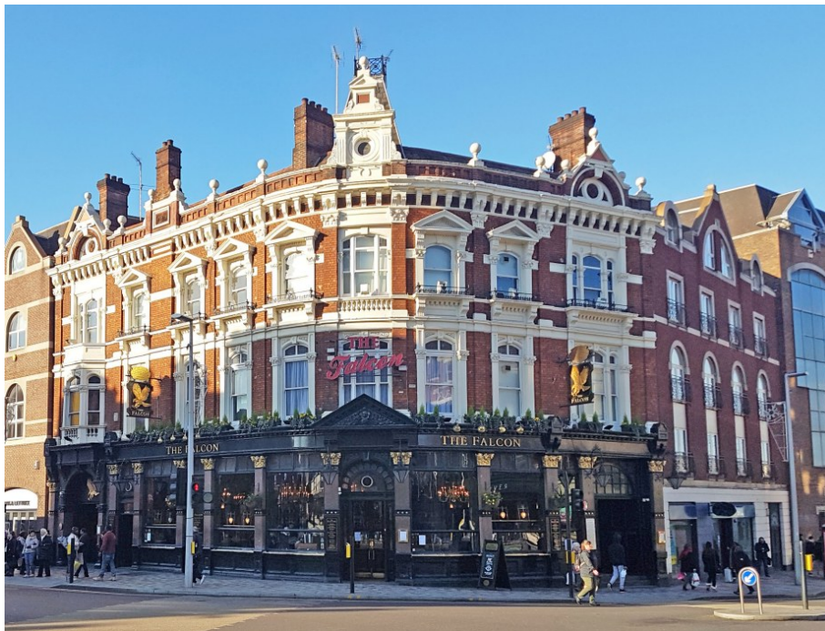
Picture 8.11 The Falcon Public House, 2 St. John's Hill, SW11 (grade II)