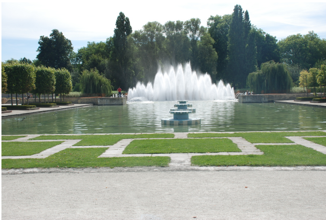
Picture 8.16 Fountains, Battersea Park, SW11 (grade II* Registered Historic Park and Garden)