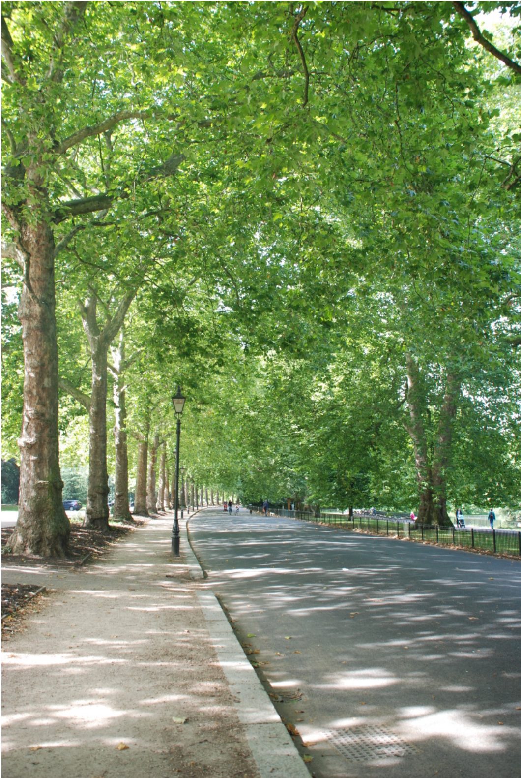
Picture 8.15 Avenue, Battersea Park, SW11 (grade II* Registered Historic Park and Garden)