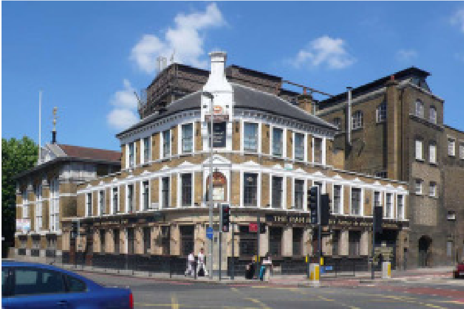
Picture 8.13 Brewery Tap Public House, Wandsworth High Street, SW18 (grade II)