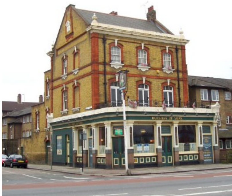
Picture 9.5 Duchess of York, 101 Battersea Park Road, SW8