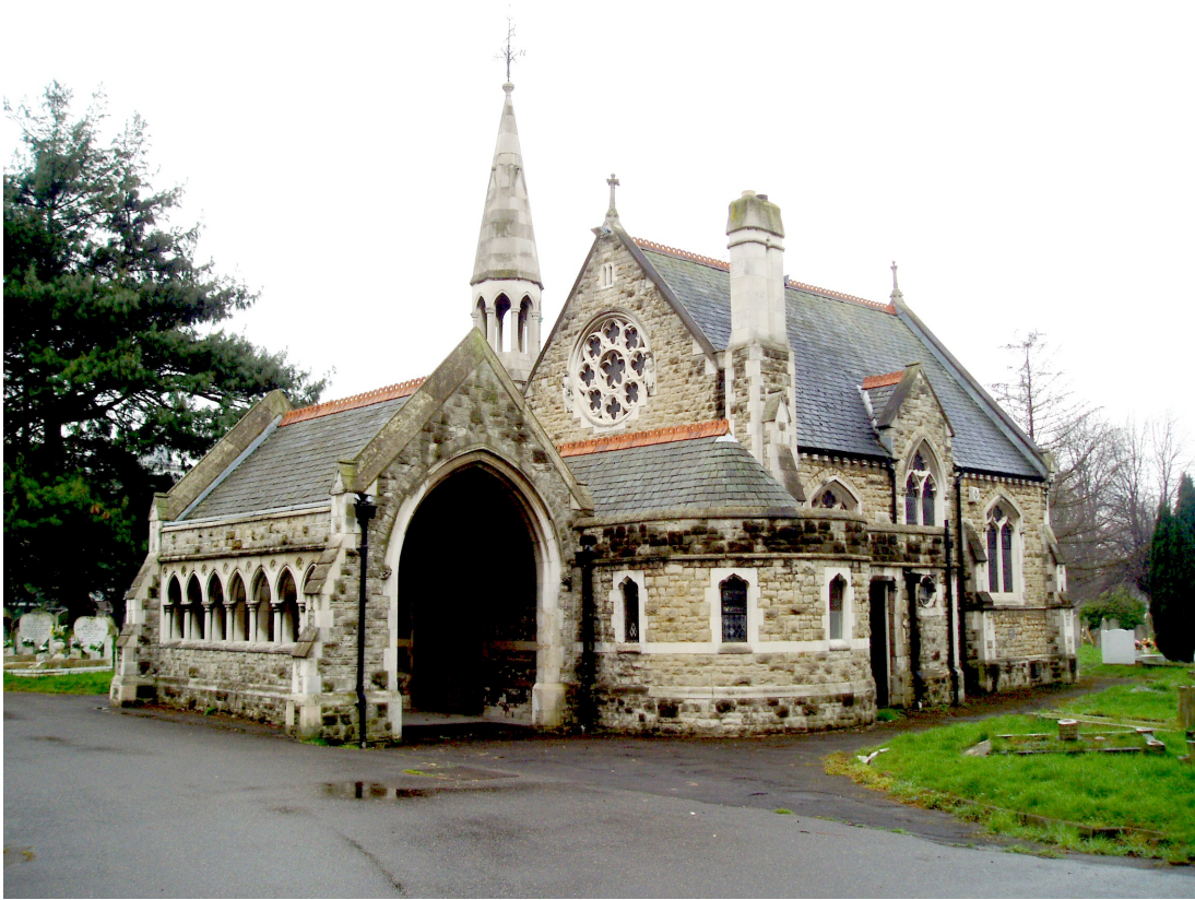
Picture 9.4 Non-Conformist Chapel, Streatham Cemetery, SW17 (Local List)