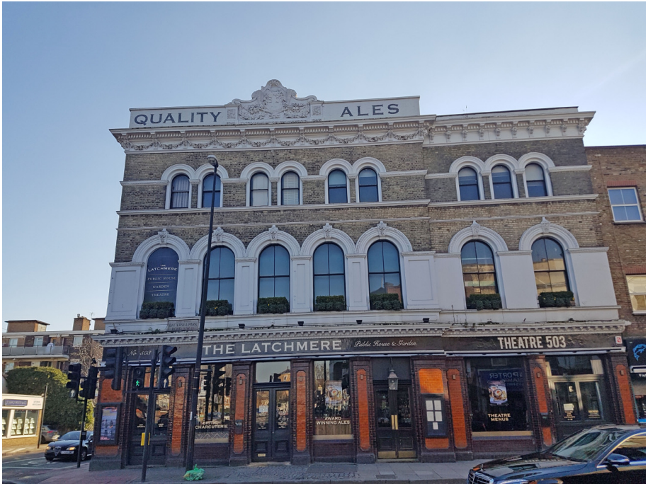
Picture 9.3 The Latchmere, 503 Battersea Park Road, SW11 (Local List)