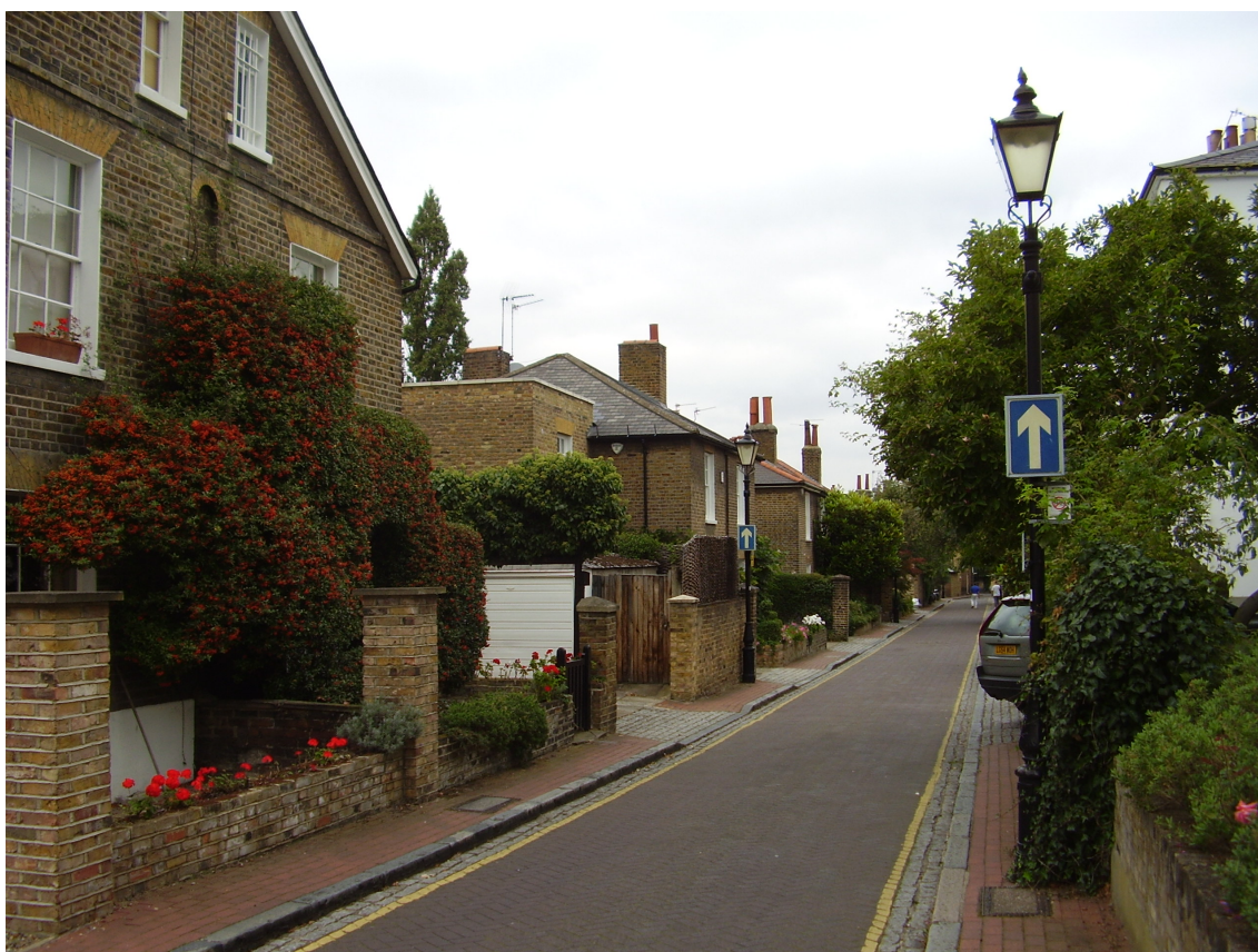
Picture 3 Parkfield's public realm

4.21 The street has been the subject of a late-20th century integrated highways engineering programme, with grey herringbone paviour roadway, granite sett gutters, granite kerbstones, red brick pavements and granite set crossovers; the latter have been designed as double width entrances, despite the fact that they are bisected by the party walls between properties. Low reproduction Victorian style streetlamps have been installed. Parking on the street is restricted and all properties have off street parking.