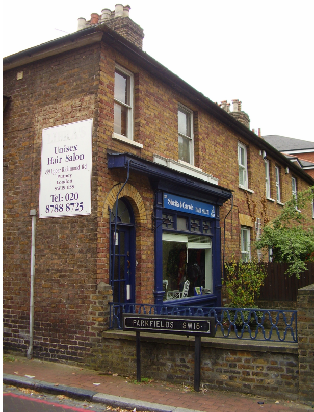
Picture 2 A shopfront on Upper Richmond Road