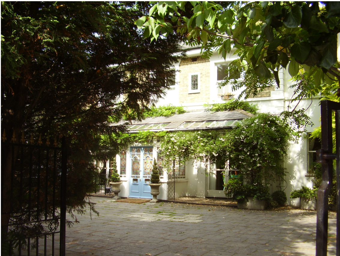
Picture 5 A similar Nelson House as seen today

5.4 The originally slow development of these plots was accelerated by the railway cutting off these roadside plots from the rest of the field system. Today, the buildings have a mixed domestic and professional uses such as doctors' and dentists' surgeries.