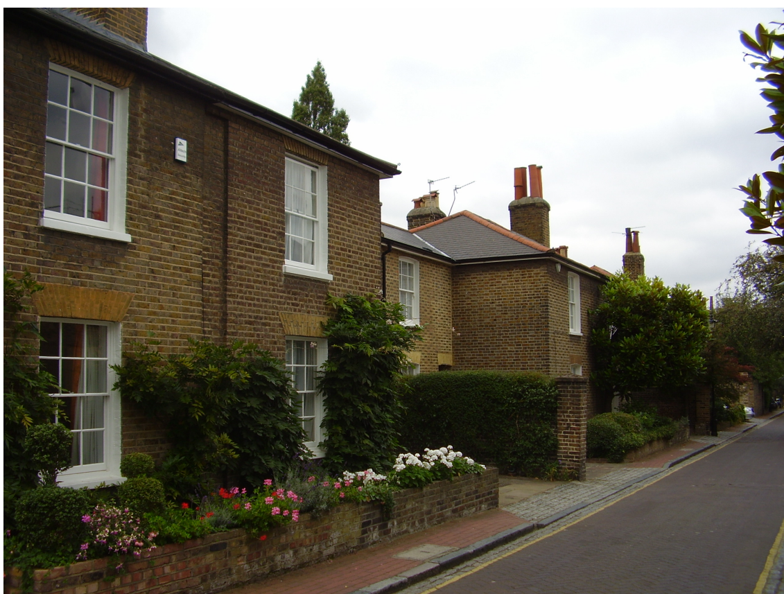
Picture 1 Cottages in Parkfields

4.2 There is a unity to the appearance of the cottages in both design and materials. Most have been extended with two storey side wings, some more successfully than others but generally the extensions have eroded the spatial quality of the original semi-detached pairs of cottages. There is little evidence of the original front boundary walls and most have now been replaced with a variety of either inappropriate or poor quality boundary treatments that have tended to detract from the unified appearance of the cottages.