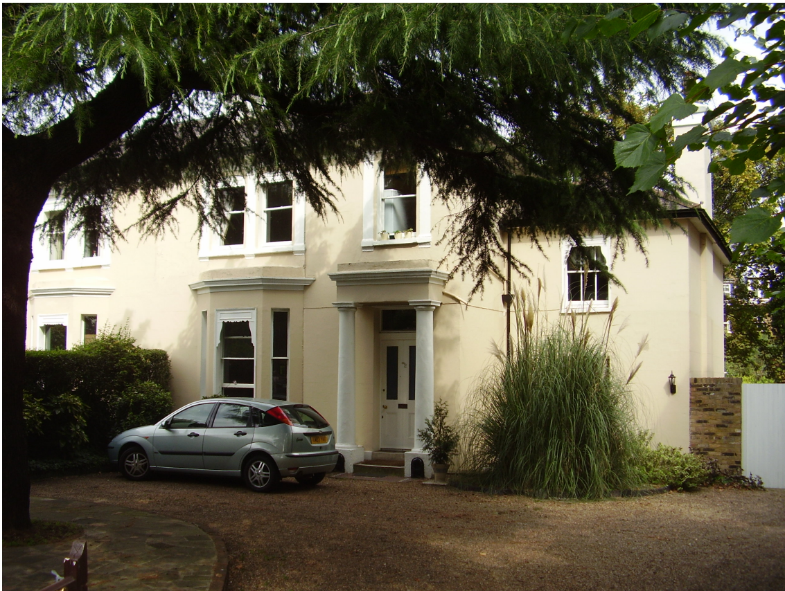
Picture 6 A Nelson House with a beautiful Cedar tree in the front garden

5.12 There has been pressure in conversion for parking space in the forecourts and for often large extensions to the villas, which have in some cases competed with the main buildings. There are also some examples of poor quality or inappropriate boundary treatments.