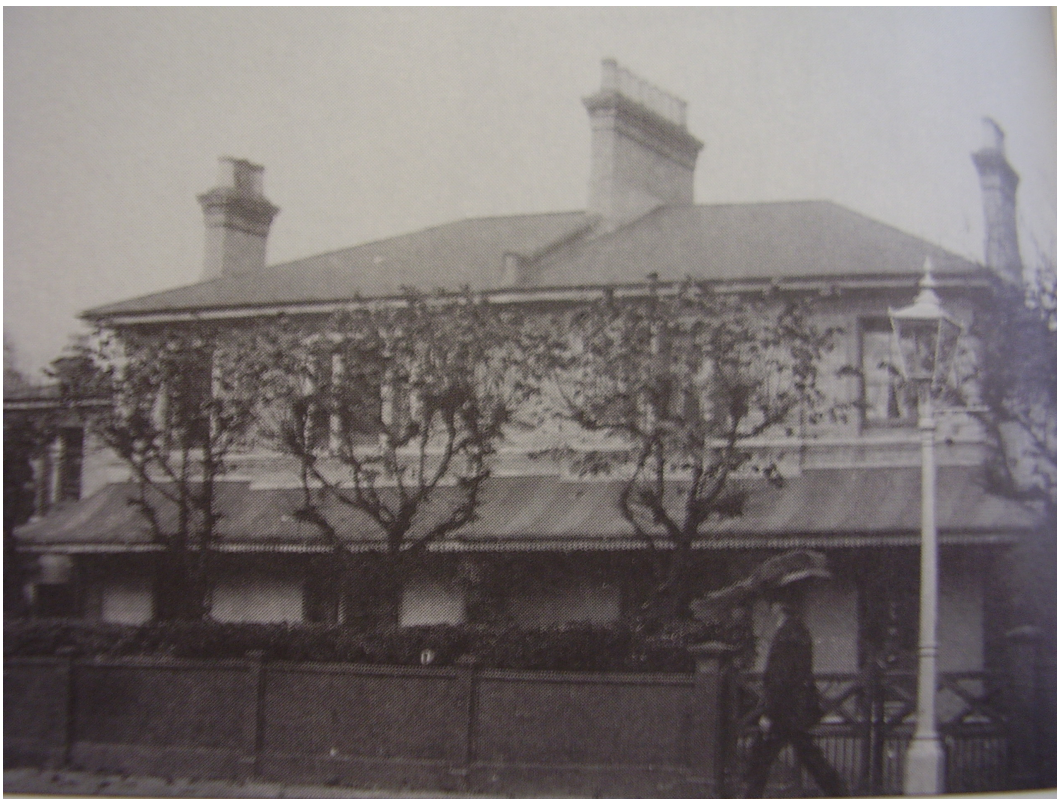
Picture 4 A pair of Nelson houses in the 1930's

5.1 This group of elegant, well-proportioned villas provide a noticeable contrast to the surrounding buildings along Upper Richmond Road. There is a superficial resemblance between all the houses: all are of two storeys, stock or possibly Gault brick; in a late Regency domestic classical style; with typical shallow pitched hipped roofs. There is a degree of formality about their general arrangement that provides a unified and cohesive character.