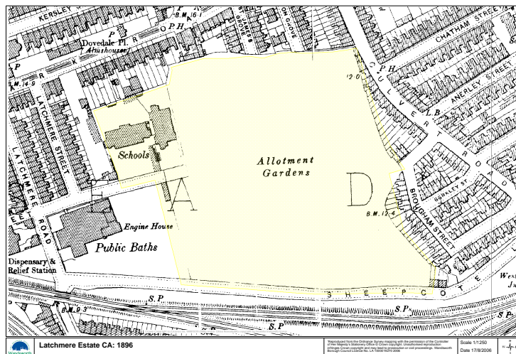
Picture 3 The area in 1896 before the estate was built

5.2 The resultant housing - the first municipal housing in the country built using a council's own workforce - was officially opened in 1903 by John Burns. Some 15 years later 26 more dwellings were added to the northern side of the Estate resulting in the extension of Reform Street and the enclosure of the recreation ground. The streets were named after trade union leaders.