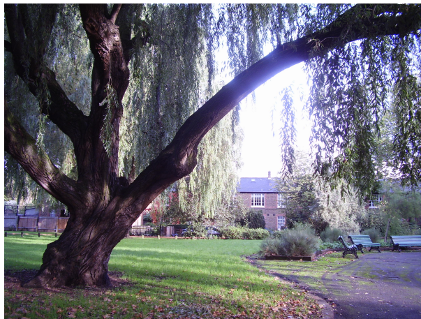
Picture 5 Weeping willow frames Reform Street

8.1 The recreation ground is the most dominant landscape feature. It has been laid out with a children's playground as its focal point and around this is an informal landscaped garden with mature tree planting. To the south of Burns Road the regular grid of streets contains an equally regular arrangement of street tree planting - mostly pollarded Plane trees. These trees are a very important element in the character of this part of the Conservation Area.