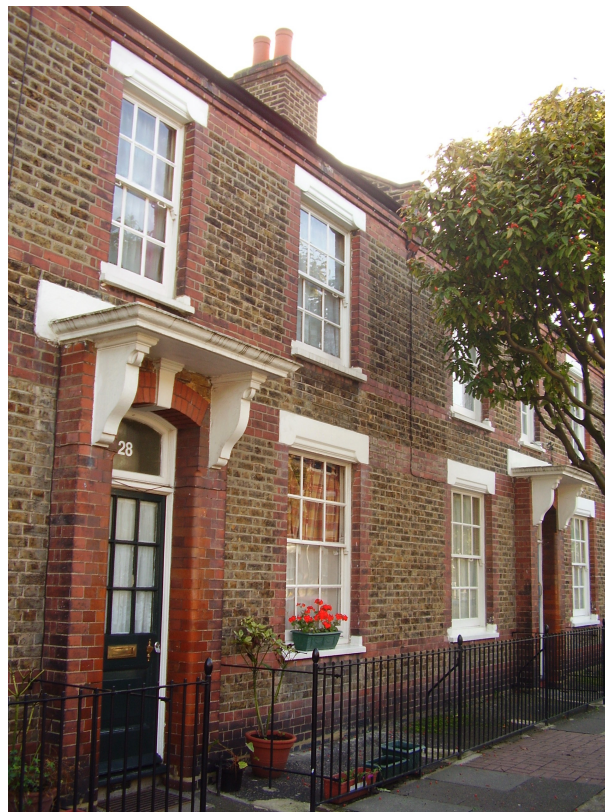
Picture 4 Projecting canopy over the front door. Timber sliding sash windows

segmental arch. Roofs are covered with Welsh slate capped with red terracotta ridge tiles. Houses on the earliest part of the Estate, south of Burns Road, have narrow forecourts, which were originally defined by cast metal railings. These were removed during the Second World War leaving no boundary to the footway. The houses erected later in Reform Street have larger windows and the same roof and wall treatment but lack the robust moulded window heads and entrance canopies. These are simpler cottage style houses and this theme is carried through on the north side of the recreation ground where houses lie behind small front gardens bounded by timber fences and privet hedging.