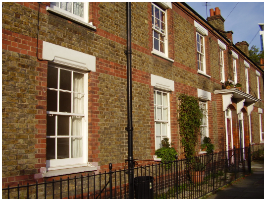
Picture 1 Maisonettes in the Latchmere Estate

2.1 The Latchmere Estate Conservation Area was designated on 19th September 1974. The special character of the area derives from the fact that little has changed since the Estate was completed in 1903. Latchmere was the first municipal housing estate in the country to be built using a council's own workforce. The most striking feature of the Estate's appearance is the uniformity of the terraces. There is no variety between individual houses and little variety between terraces. Consequently, an alteration to the appearance of any one house spoils the uniformity of the terrace and can spoil the appearance of the whole street. Overall, there is a unity and totality about the area deriving from the simple, complementary nature of the architecture.