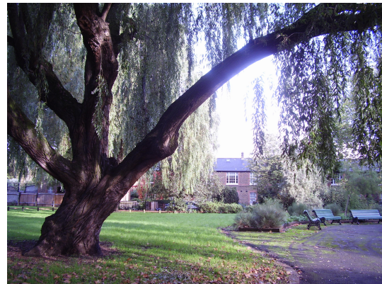
Picture 2 Looking across park to Reform Street