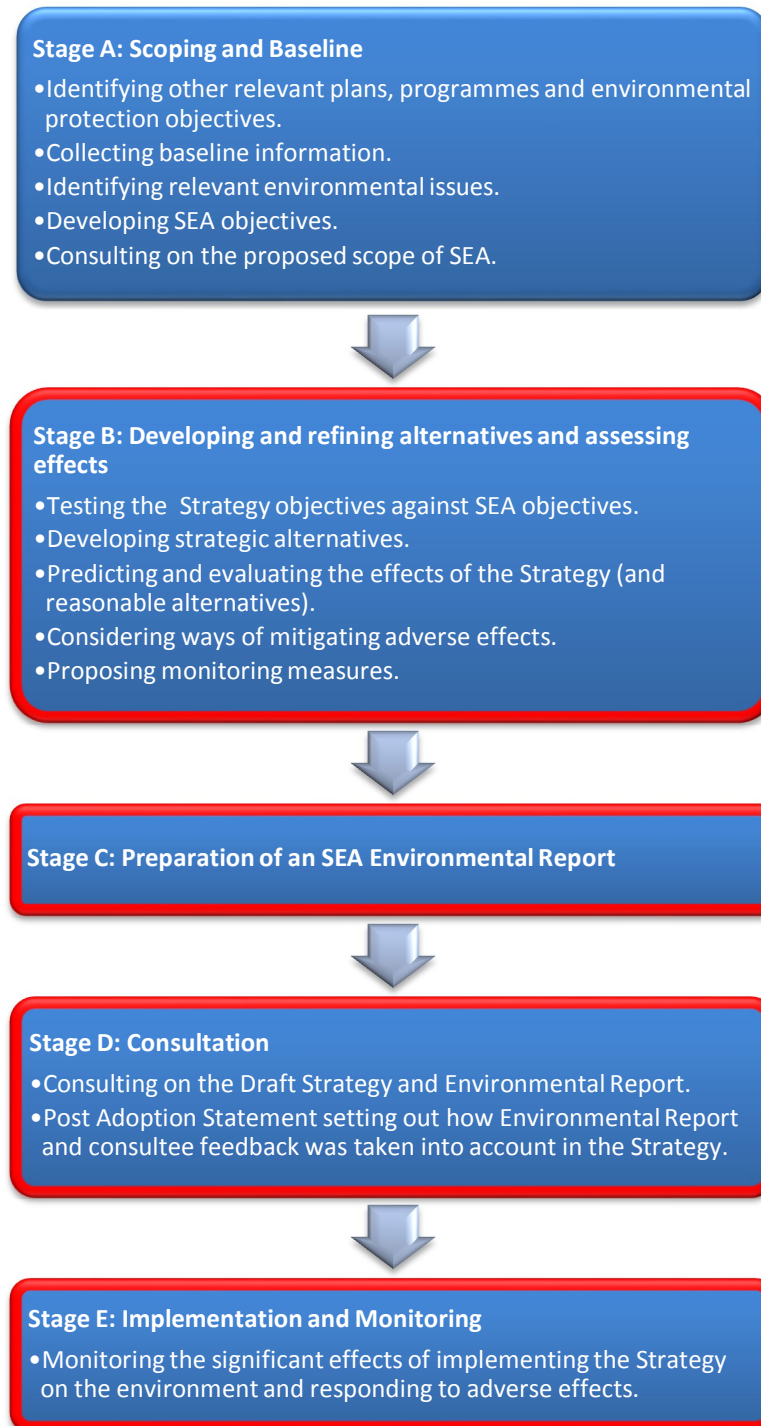
Figure 4.1: Relationship between SEA stages.

Stage A and the associated tasks were carried out and reported in the Scoping Report. This Environmental Report documents Stage B to D of the SEA process, as highlighted in red in Figure 4.1, in order to meet the requirements of Regulation 12(3) of the SEA Regulations.