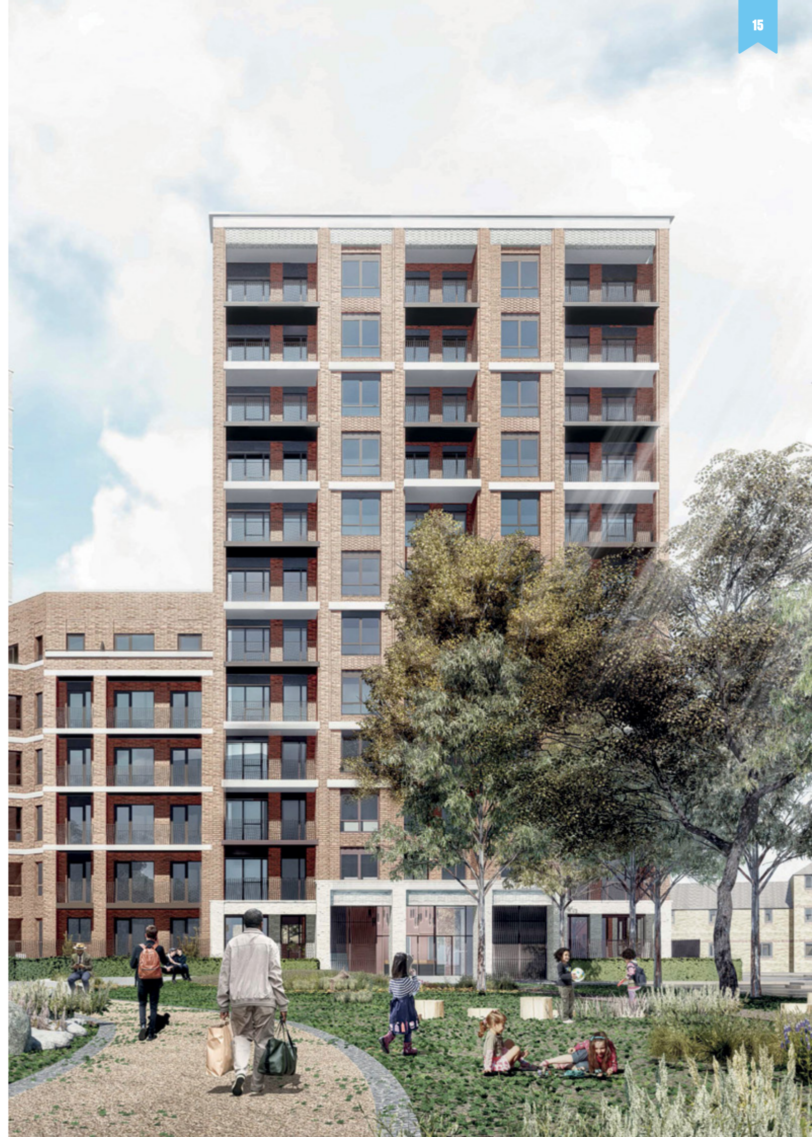
Image: View towards Block 5 from the park

This applies only to general needs housing. Homes designed for wheelchair users will be allocated as 4.6.