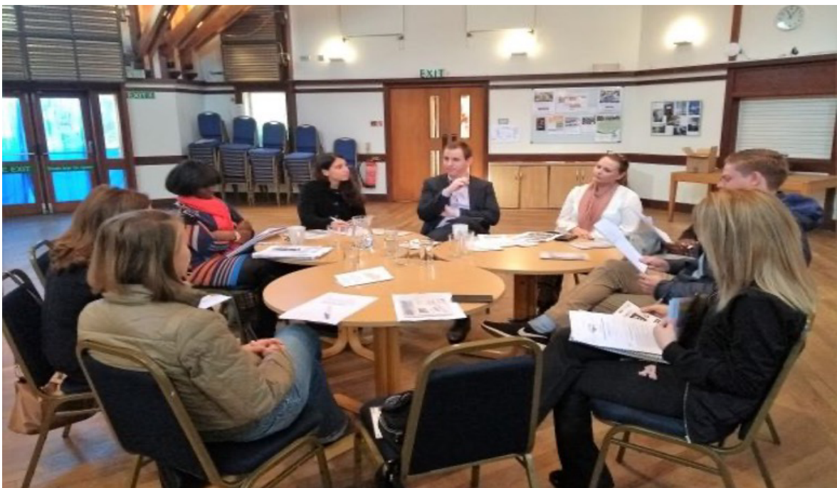
'Get to know your community' event at Age UK

10.2 The progress made in 2019/20 has helped to shape the way forward for the coming year. It is anticipated that 2020/21 will enable positive progress in the way that we promote a learning culture that aims to support high quality relationship-based practice in adult social care to enable excellent outcomes for our local communities.