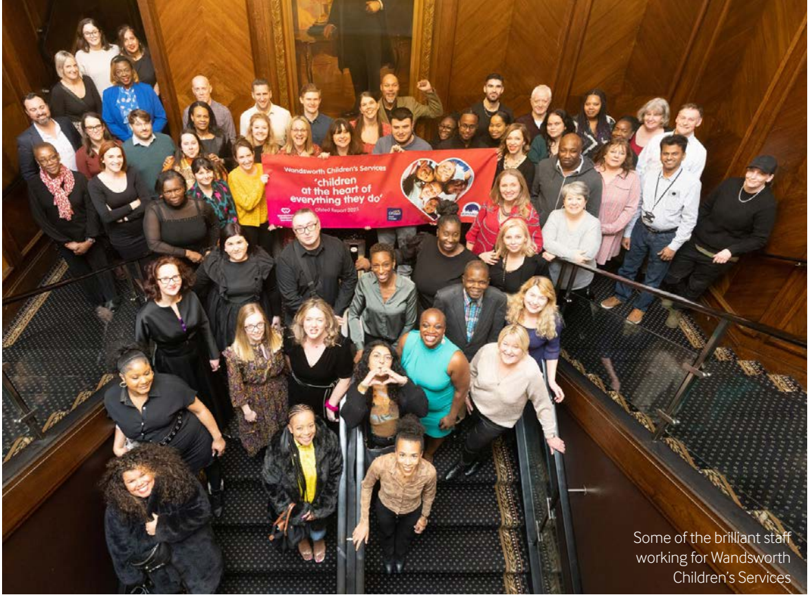
Some of the brilliant staff working for Wandsworth Children's Services