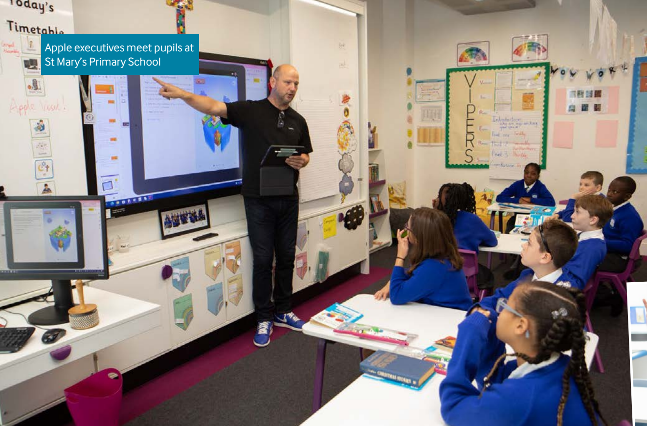
Apple executives meet pupils at St Mary's Primary School