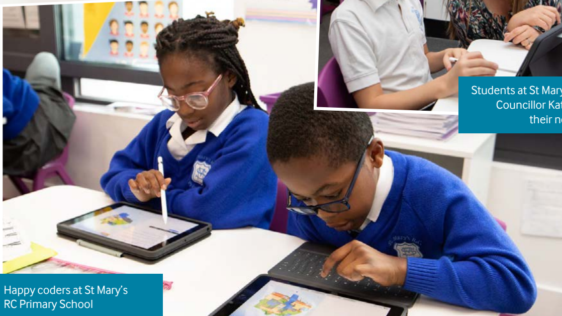
Happy coders at St Mary's RC Primary School