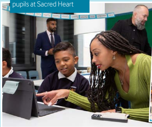
Apple executives meet pupils at Sacred Heart