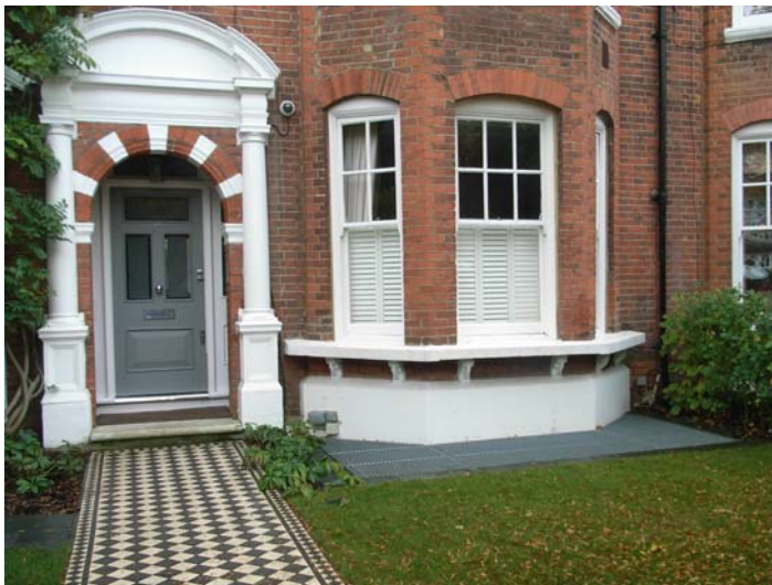
Front lightwell incorporating security grille with over half of the depth of the garden retained

We have produced this factsheet to steer you through the steps you need to take, to advise residents (and neighbours) of the controls we have at our disposal and to offer up advice and good practice for drawing up a successful scheme and avoiding problems during the construction process.