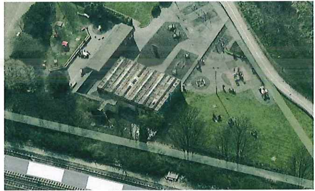
SATELLITE VIEW OF THE EXISTING SITE