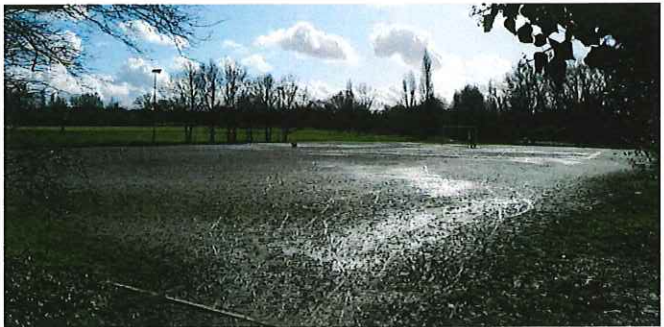
EXISTING SPORTS PITCH