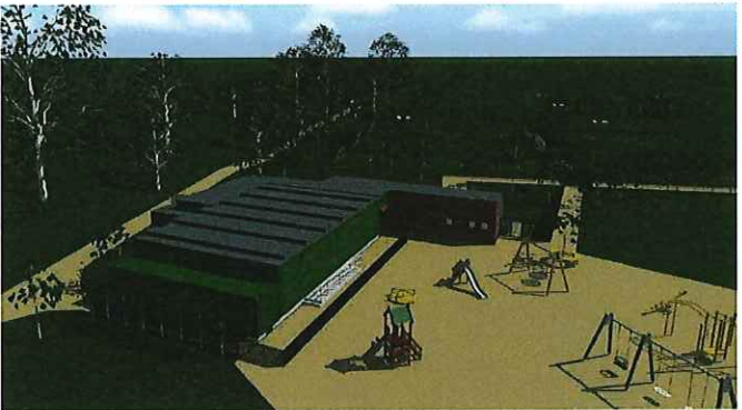
CGI OF THE REFRUBISHED CLUB HOUSE BUILDING