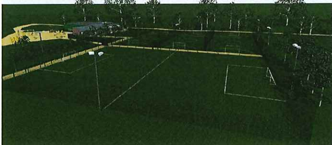
CGI VIEW OF THE NEW SPORTS PITCHES

Compete: We offer numerous opportunities for all children to enjoy competition.