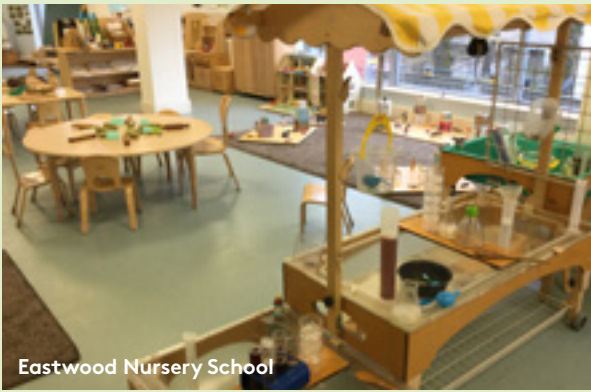
Eastwood Nursery School

“We are looking forward to building and strengthening our Eastwood community and the community we serve.”