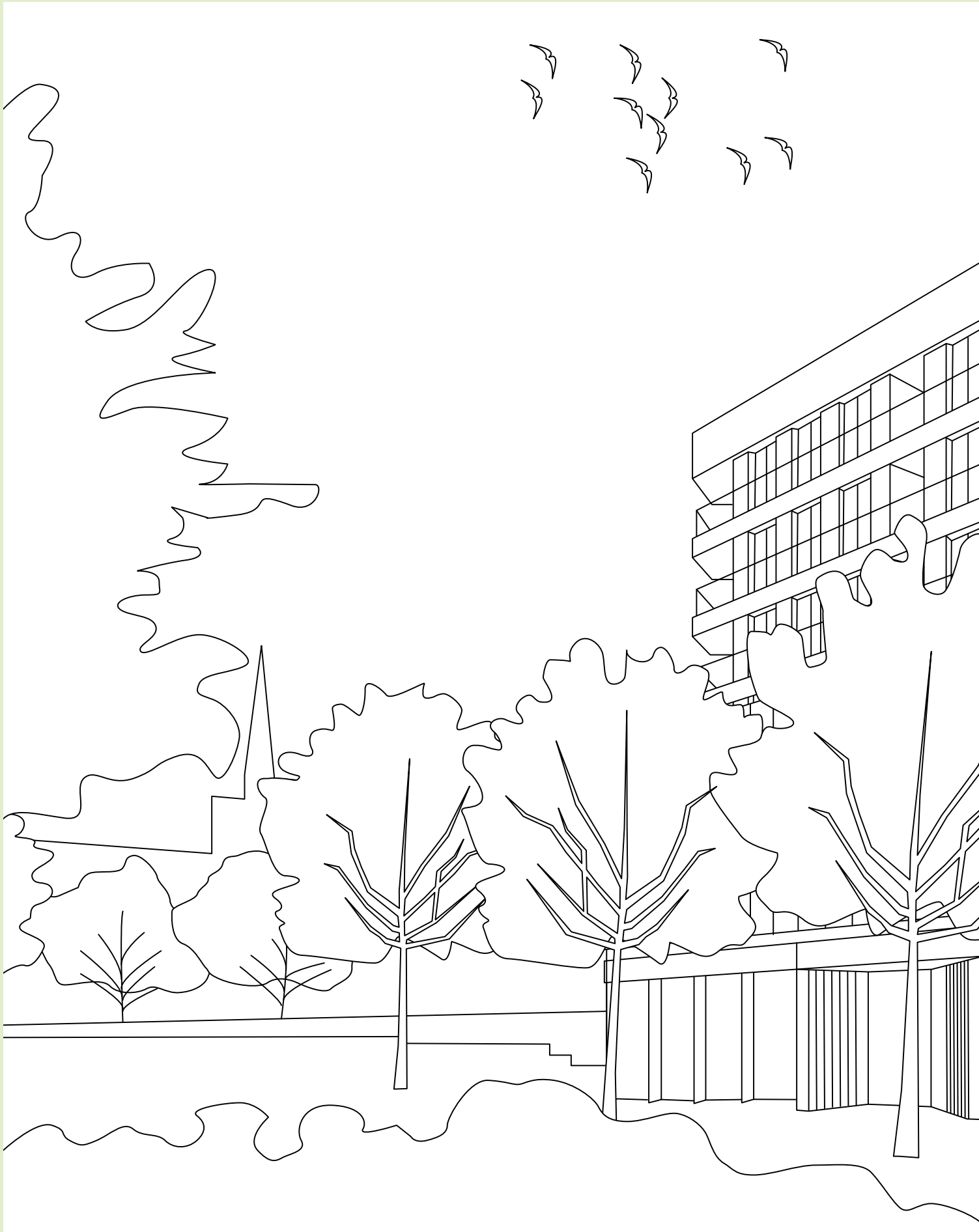
Block A: Community and residential building (based on Computer Generated Image)