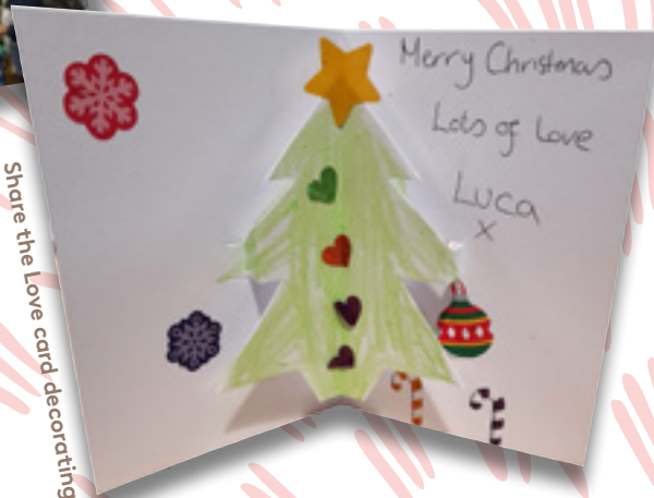
Share the Love card decorating