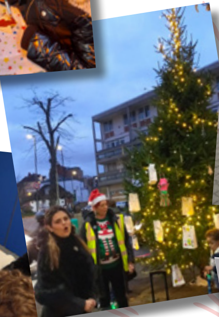
Lantern parade and Christmas tree lights switch on