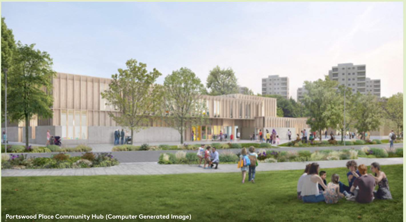
Portswood Place Community Hub (Computer Generated Image)