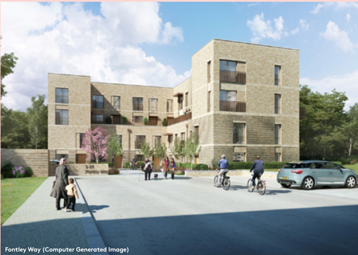
Fontley Way (Computer Generated Image)

Keep an eye on our community noticeboards, websites, and twitter page to stay up to date with Fontley Way news!