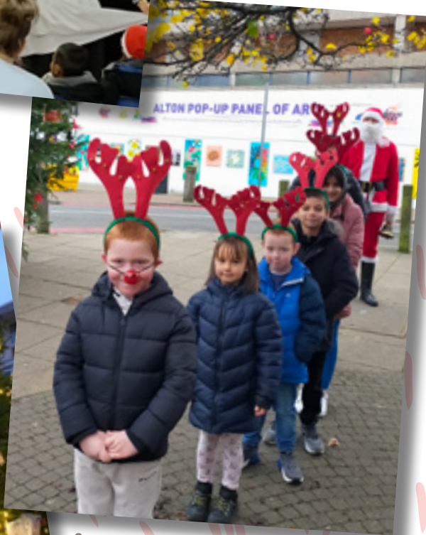
Santa's procession to the Christmas market