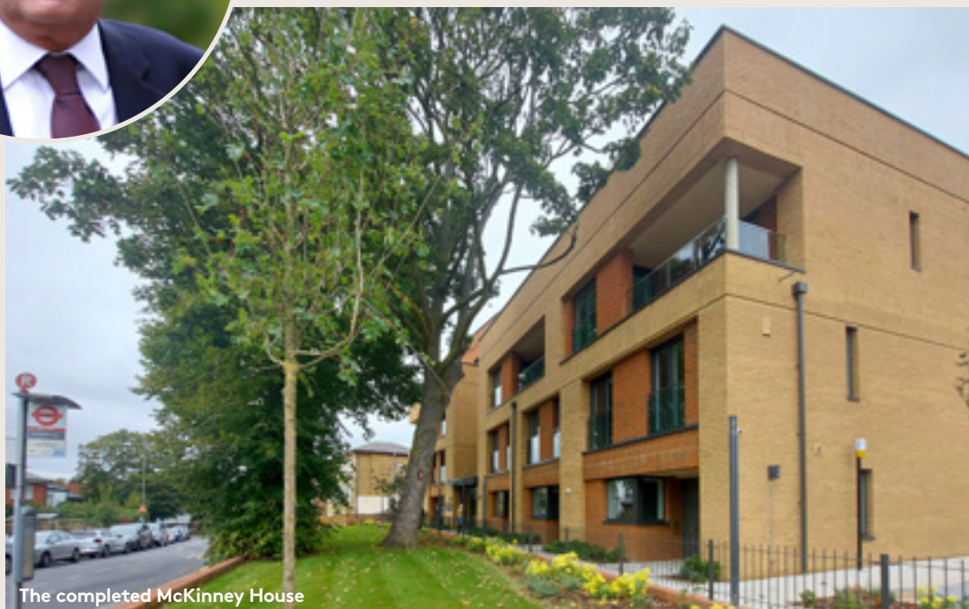
The completed McKinney House