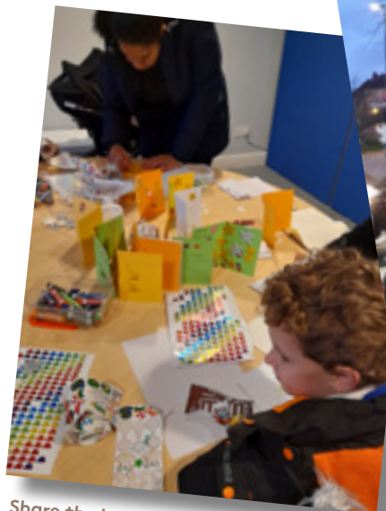
Share the Love card decorating